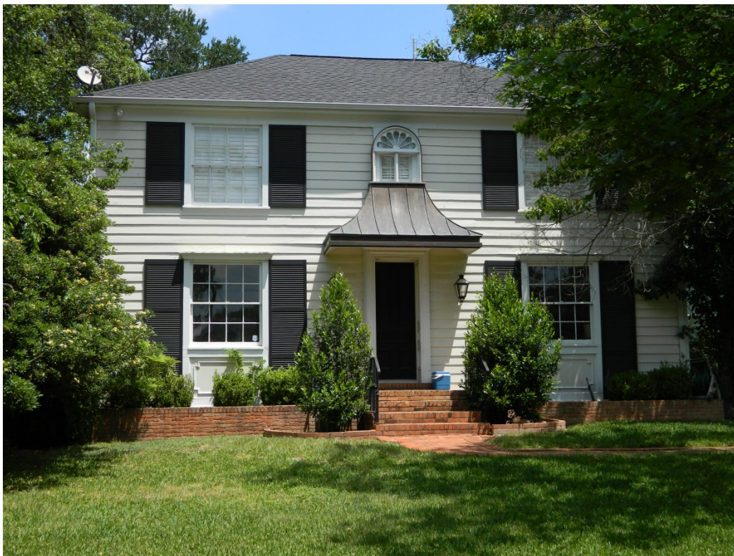
3400 Windsor Road ca. 1939