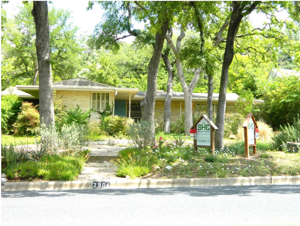
2904 Enfield Road ca. 1946