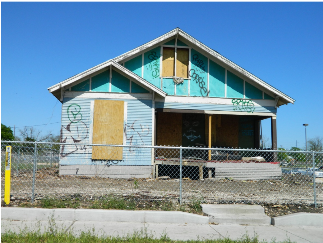
OCCUPANCY HISTORY 2105 Comal Street