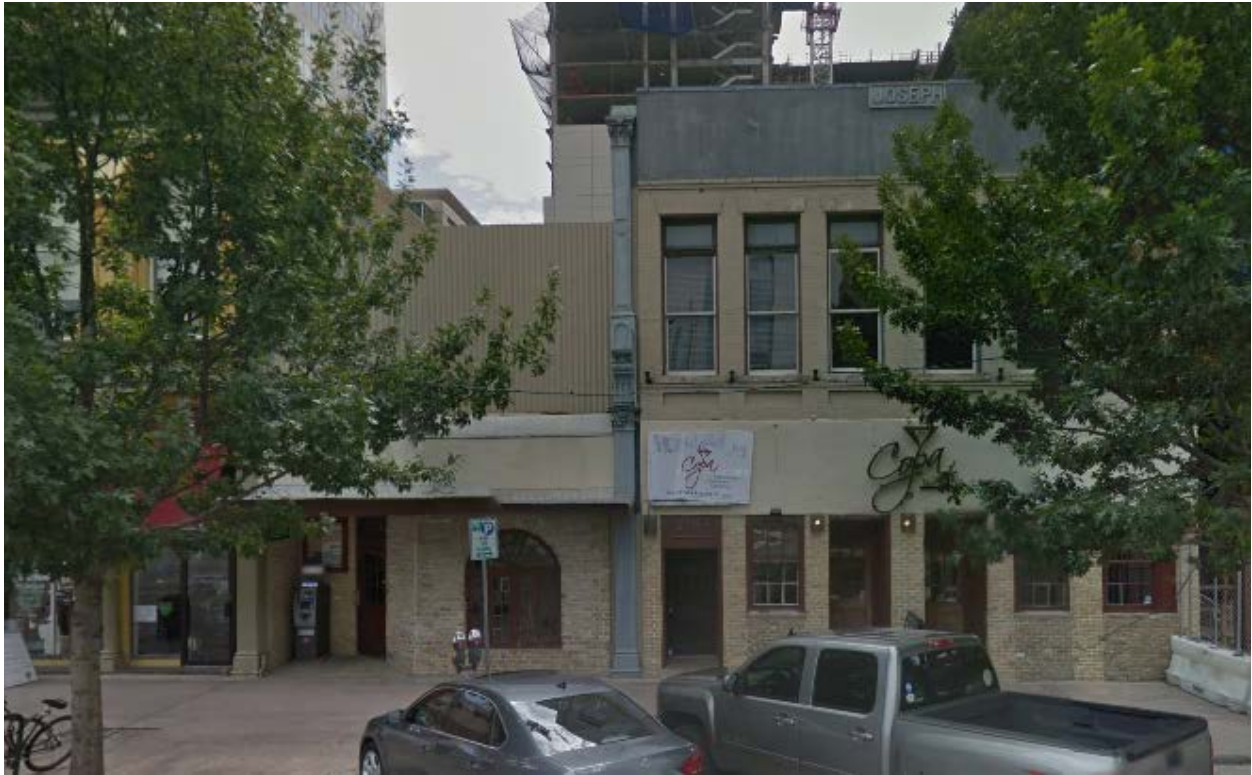
217-219 Congress Avenue