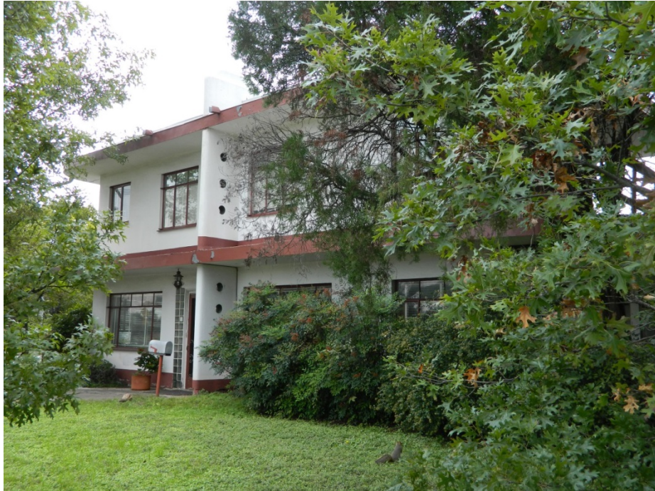
3805 Red River Street ca. 1947