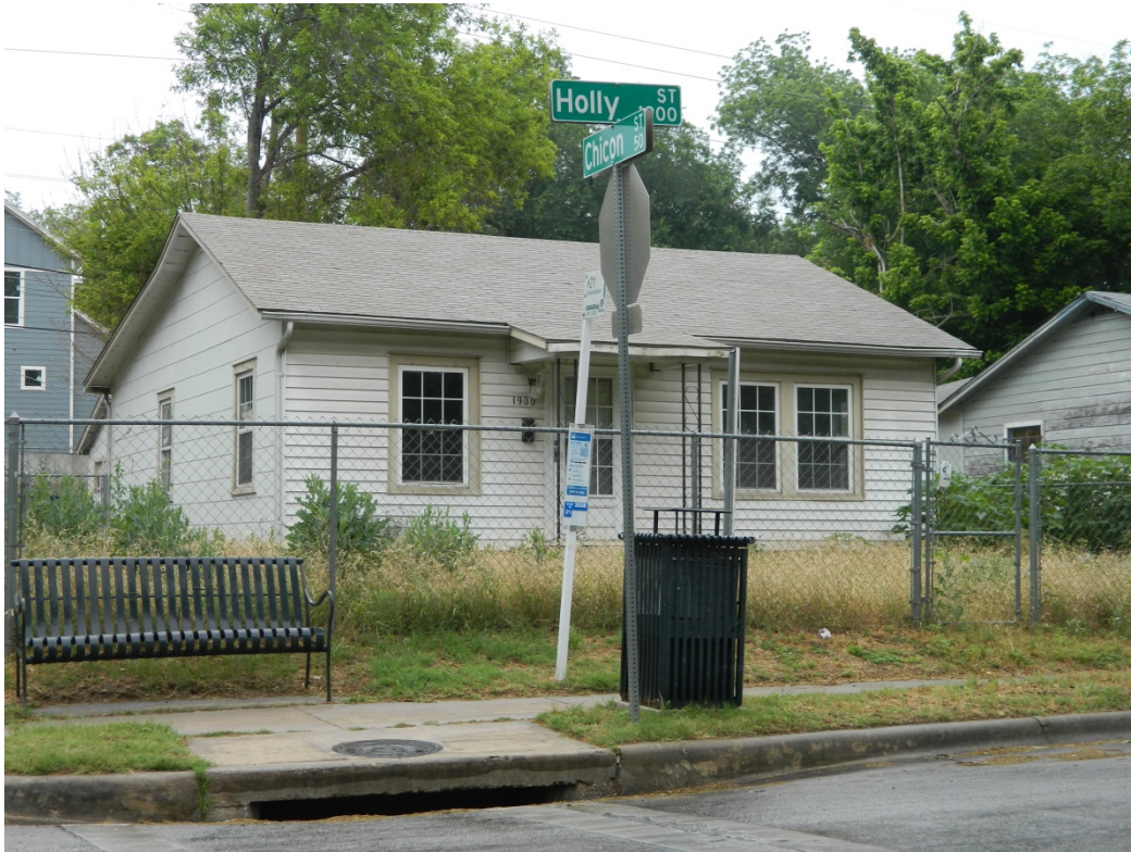
1900 Holly Street ca. 1951