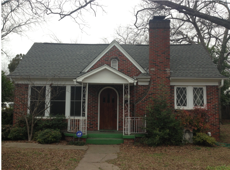
2 EXISTING FRONT ELEVATION