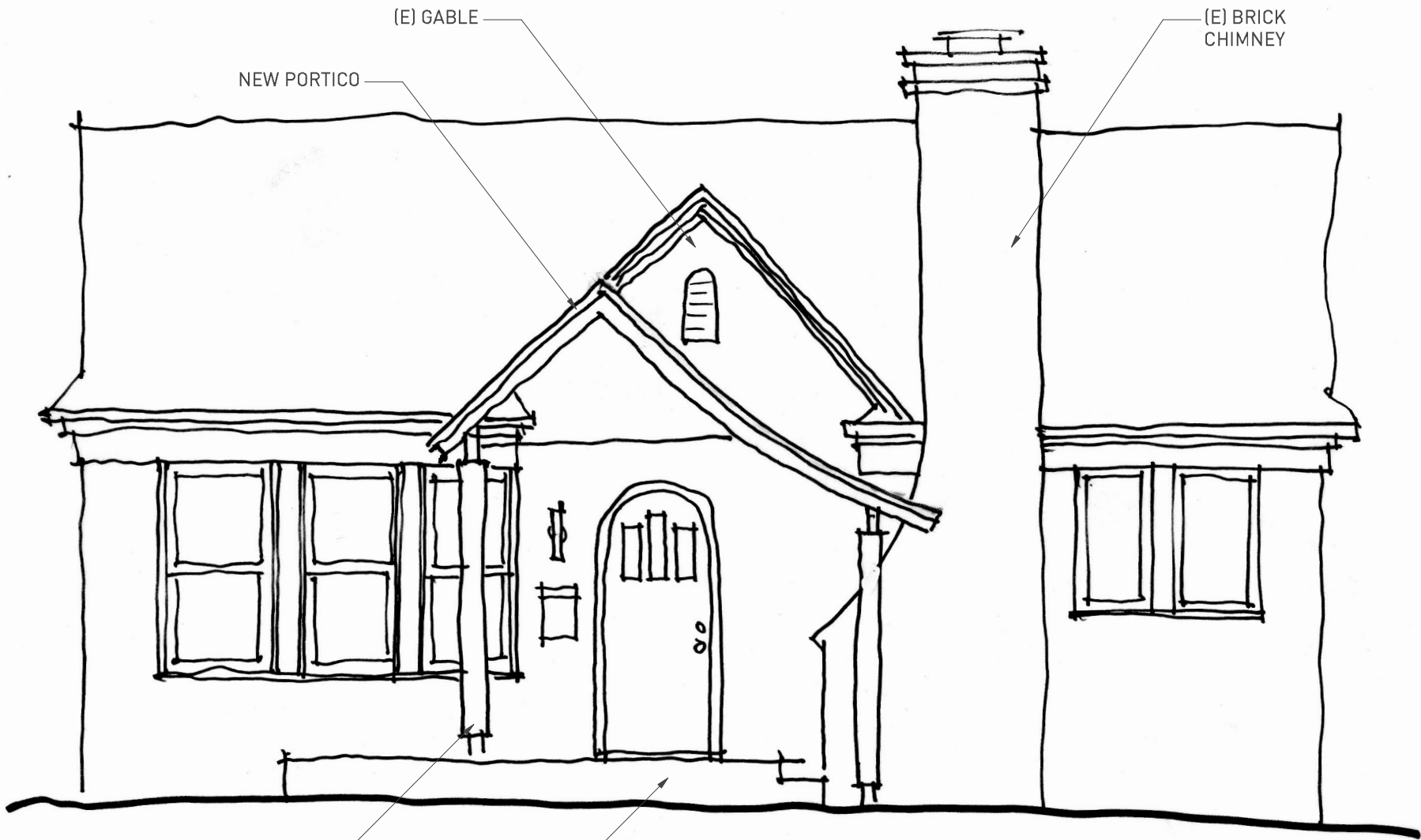
1 PROPOSED FRONT ELEVATION Scale: 1/4" = 1'-0"