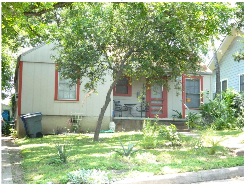
Front house – ca. 1937