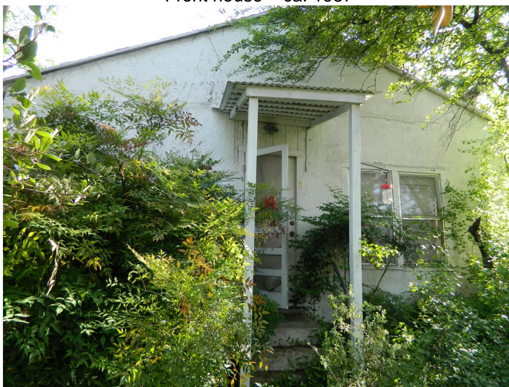
Back house – ca. 1940 OCCUPANCY HISTORY 509 Lockhart Drive