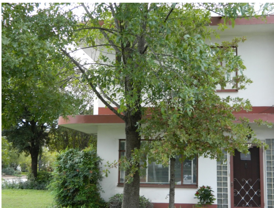
Detail showing the rounded corner of the canopies on the first floor