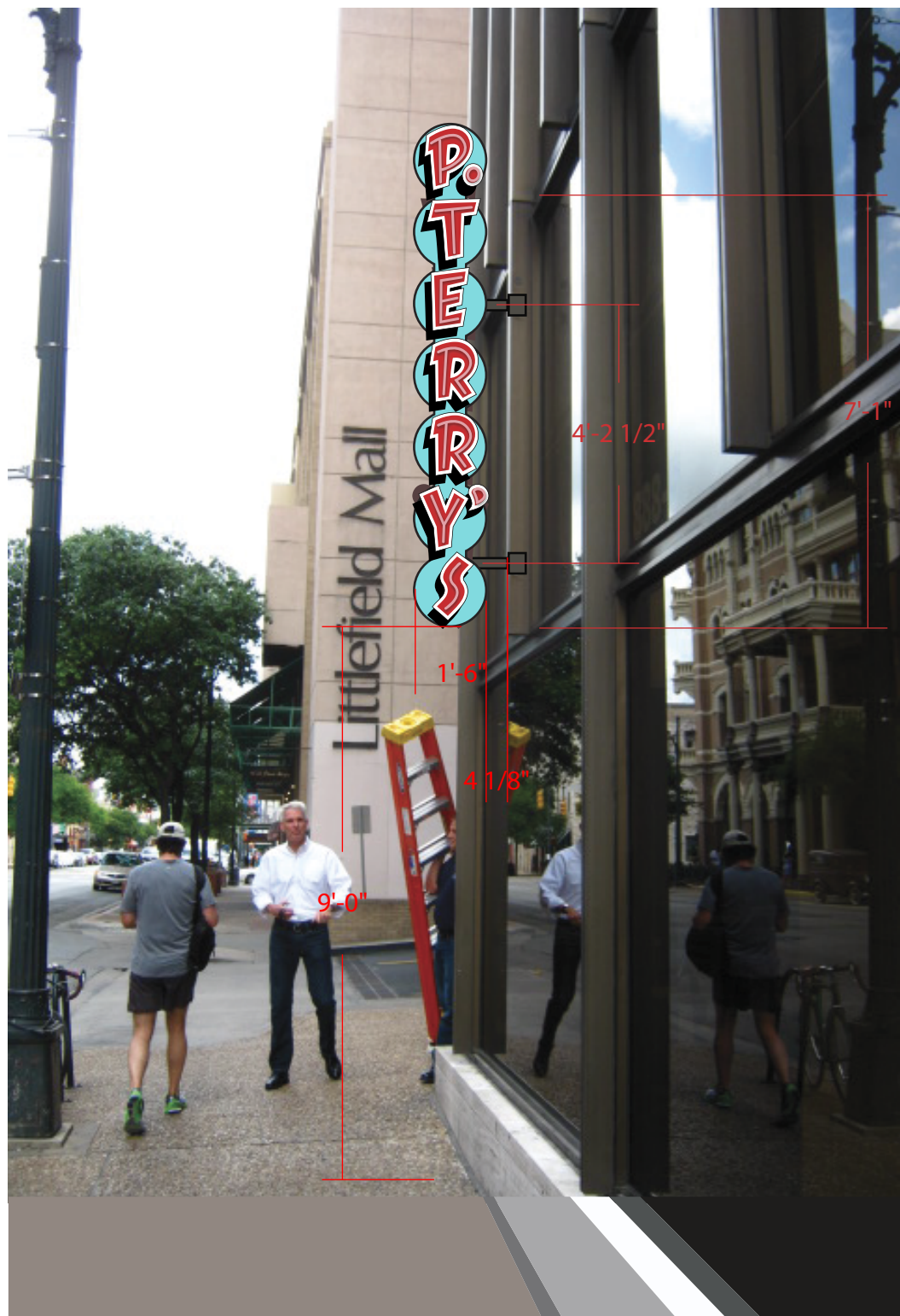
B D/F FLAG MOUNT SIGN SCALE: 3/8" = 1' 0"