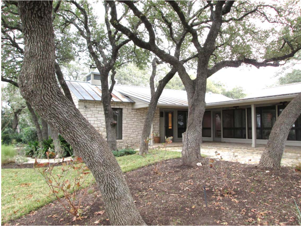
4604 Ridge Oak Drive ca. 1949