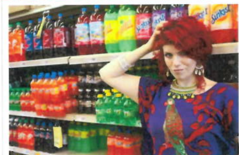
THE GOOD EYE: SETTLERS OF CAFTAN