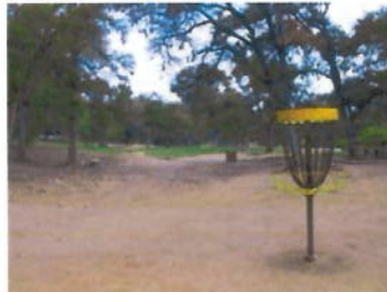
A city report points to "trampling and soil compaction" in the area surrounding this disc golf basket at Pease Park.