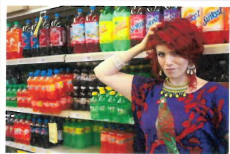
THE GOOD EYE: SETTLERS OF CAFTAN