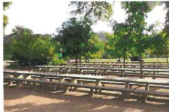
Young trees take root at Pease.

In 2007, the Lady Bird Johnson Wildflower Center released an "ecological assessment" of Pease Park concluding that the park "is being loved to death." Heavy use by hikers and runners, disc golf and volleyball players, dog owners in the leash-free area, and ordinary parkgoers, the study said, had produced "significant deterioration and depletion of the landscape" including "increasing areas of bare rock and eroded, compacted soils found throughout the park." Indirect effects included "degraded wildlife habitat, less species diversity, and death or weakening of the park's mature trees with little natural regeneration of desirable plants to replace them." The result is not just a loss of natural beauty, concluded the study, but increasing deterioration of Shoal Creek as a watershed and the landscape's defenses against floods.