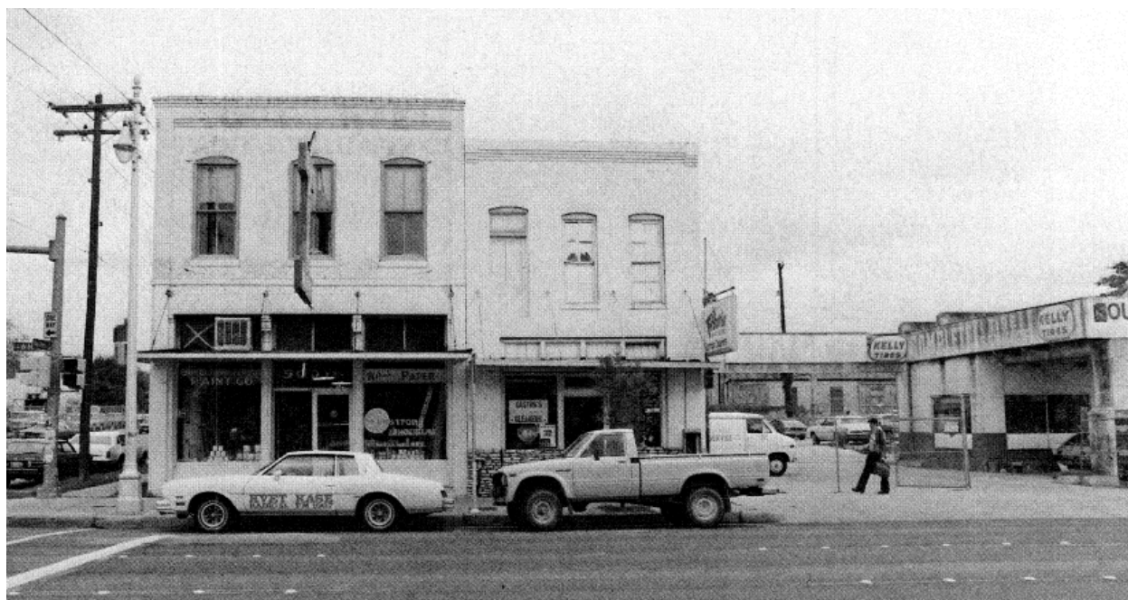
Photo of the building around 1980 shows the current 2:2 windows in the second story.