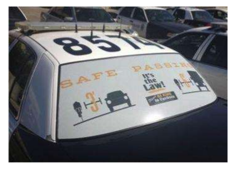
Caption: APDs Patrol Car with educational message used in the Safe Passing Law Campaign

In 2001, the City of Austin Transportation Division analyzed pedestrian and bicycle accidents that occurred on public roadways. The analysis of these accidents did not reveal any "patterns or common cause factors... and don't indicate a specific type of problem that would lead to a logical prevention strategy" (City of Austin, 2001, p. 1). It concluded that the common factor in all the accidents was a "failure to exercise caution and observe right-of-way rules [among] motorists, pedestrians, and bicyclists" (City of Austin, 2001, p. 1). The findings in this study support the comprehensive approach of this Plan to address bicycle safety. The promotion of bicycling on adequate facilities with all users following applicable laws will result in the safest environment for all roadway users.