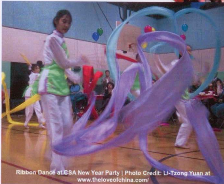
Ribbon Dance at CSA New Year Party | Photo Credit: Li-Tzong Yuan at www.theloveofchina.com/