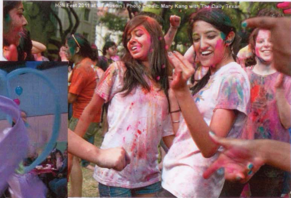
Holi Fest 2011 at UT Austin