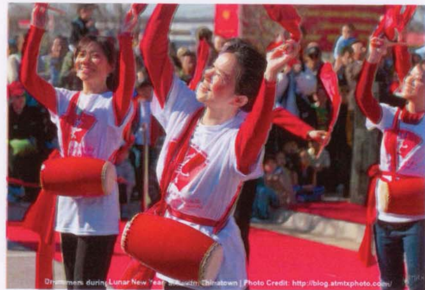
Drummers during Lunar New Year at Austin Chinatown

The City will balance its commitment to provide ample opportunities for public involvement with its commitment to delivering government services efficiently and using City resources wisely.