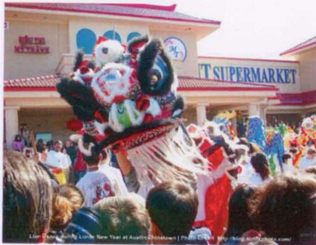
Lion Dance during Lunar New Year at Austin Chinatown