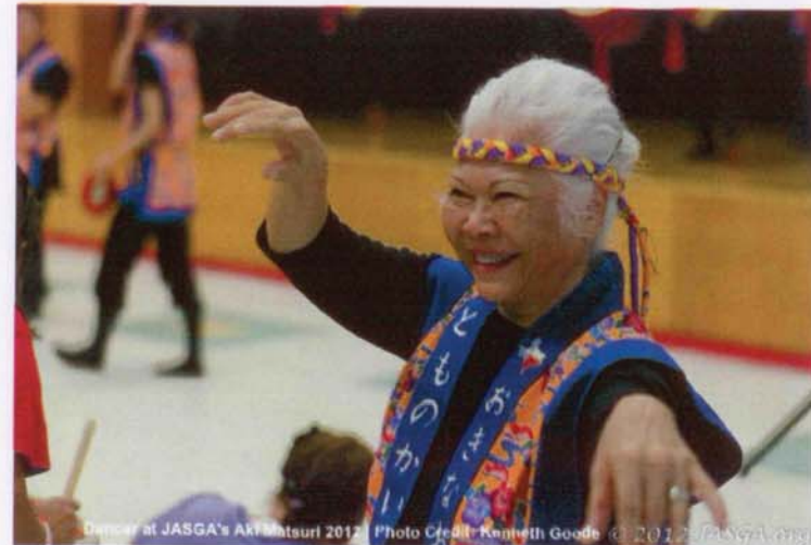
Dancer at JASGA's Aki Matsuri 2012