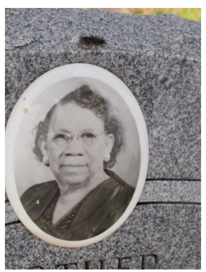
Photo of Lula Dobbins from her gravestone in Evergreen Cemetery, Austin