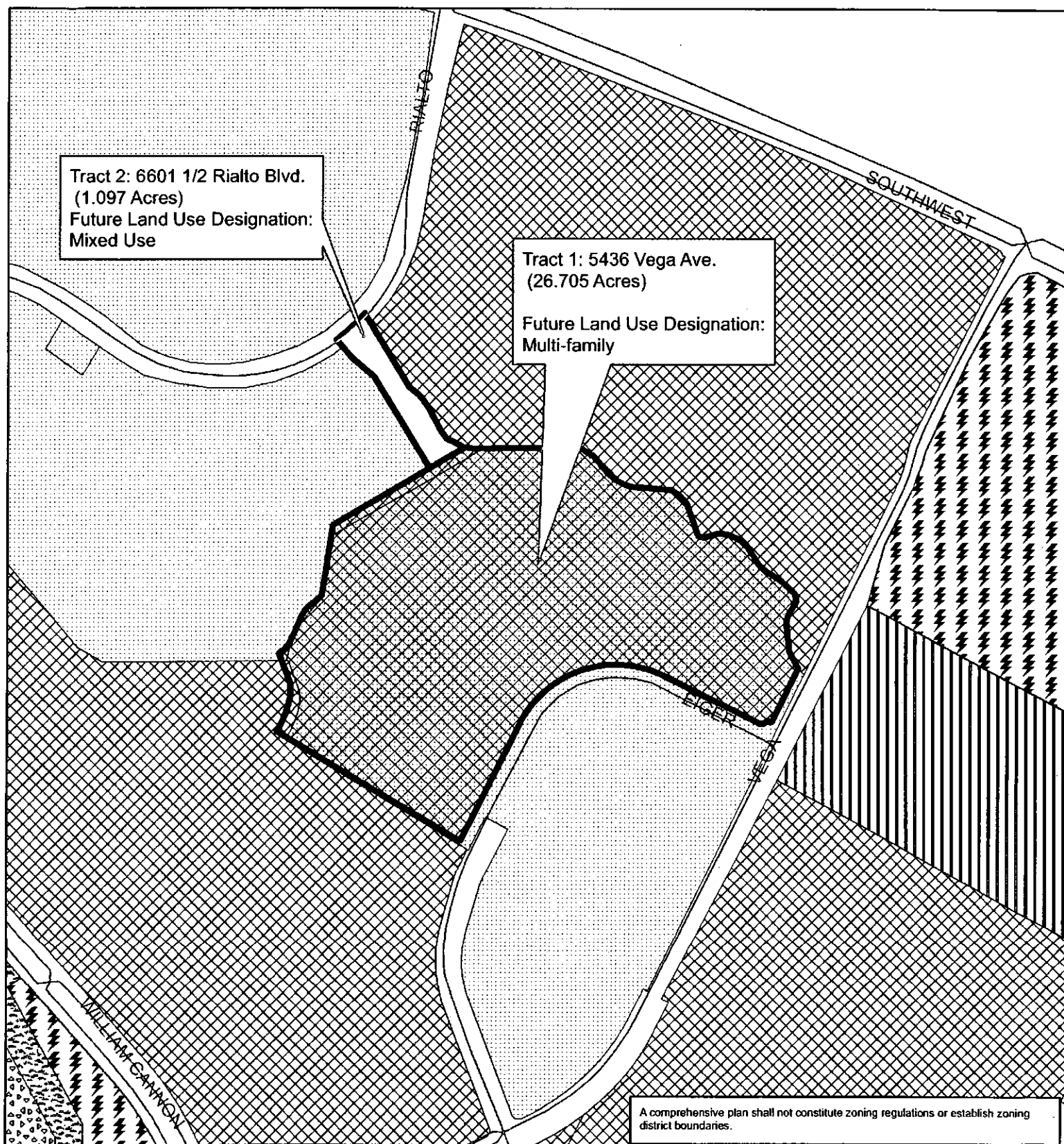
Exhibit A Oak Hill Combined Neighborhood Planning Area Amendment NPA-2014-0025.02

This product is for informational purposes and may not have been prepared for or be suitable for legal, engineering, or surveying purposes. It does not represent an on-the-ground survey and represents only the approximate relative location of property boundaries.