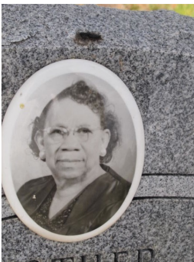
Photo of Lula Dobbins from her gravestone in Evergreen Cemetery, Austin