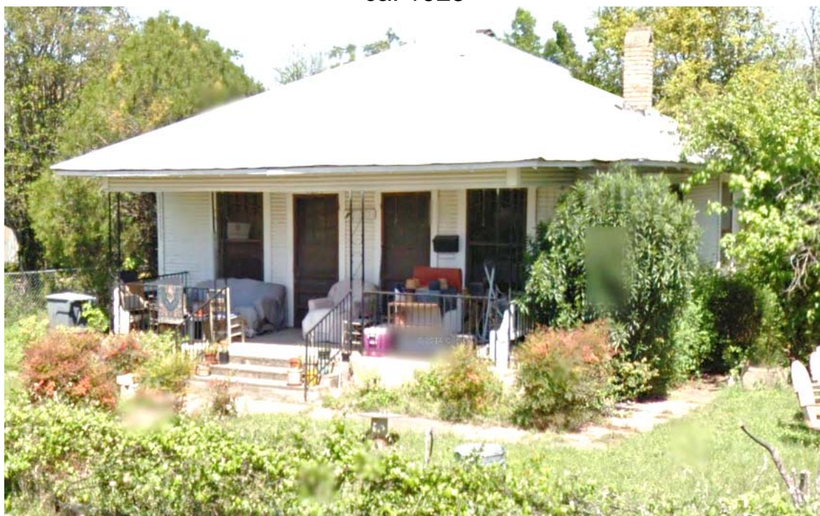
1611 Walnut Avenue ca. 1925