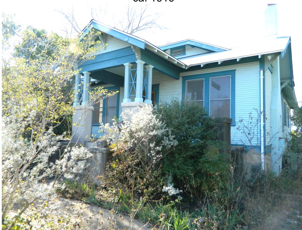
1106 Travis Heights Boulevard ca. 1919