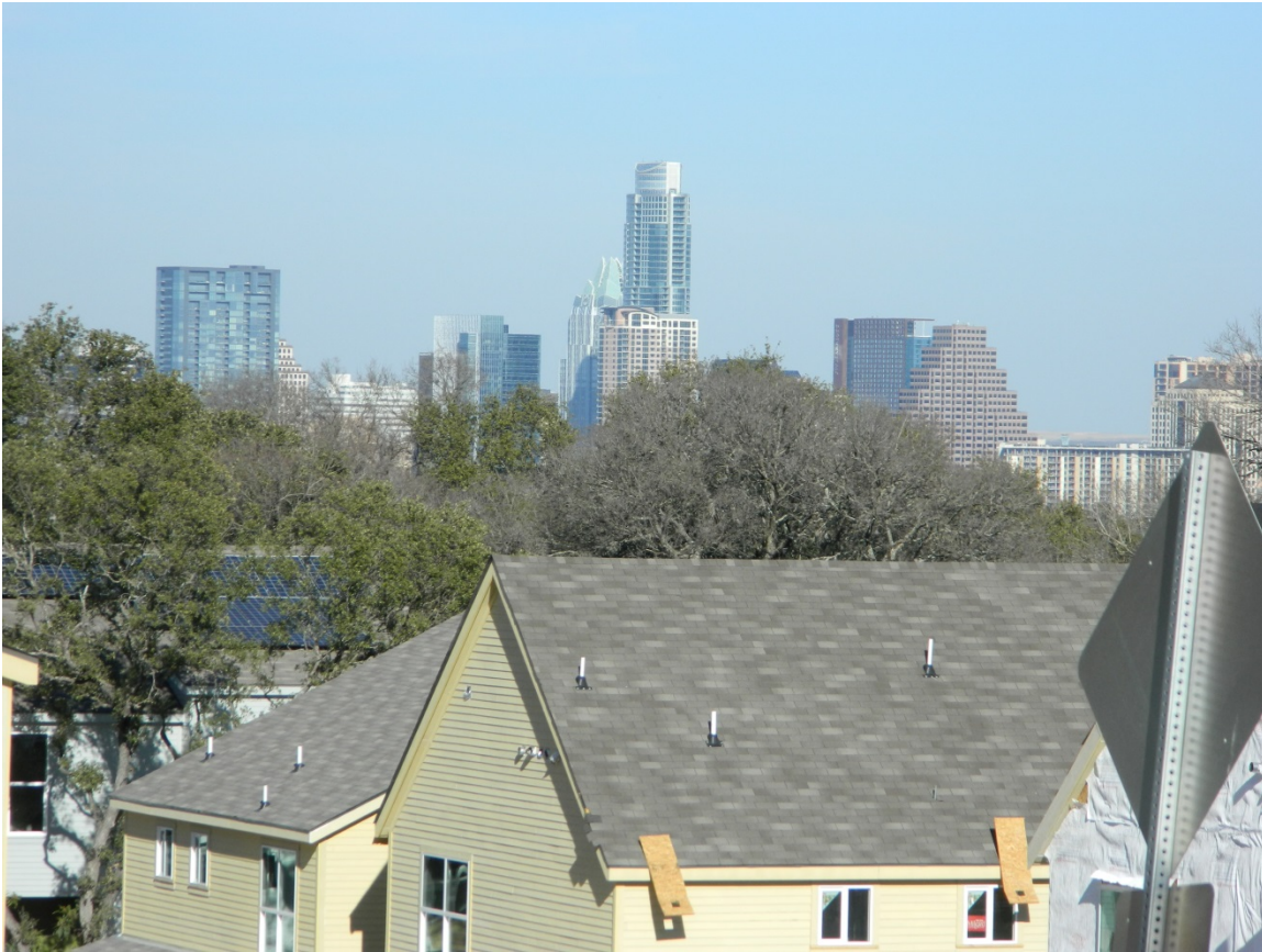
View of downtown Austin from the house