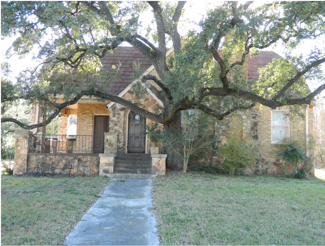
1805 Lightsey Road ca. 1932