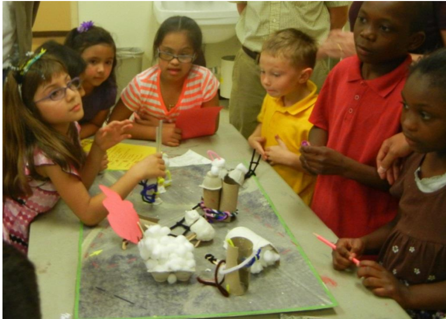
Enhanced craft activity at a PARD After School Program