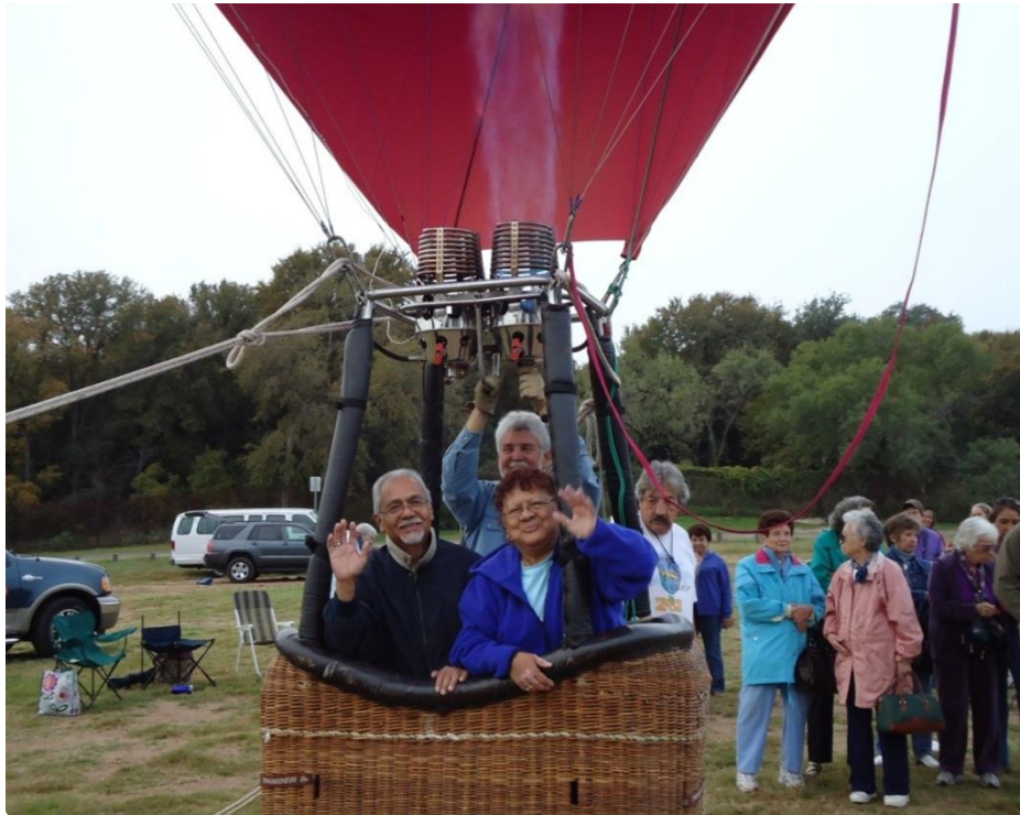
50+/Seniors Soaring into the Future