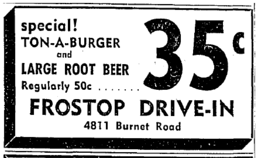
Ad for the Frostop Drive-In Austin Statesman , April 28, 1960