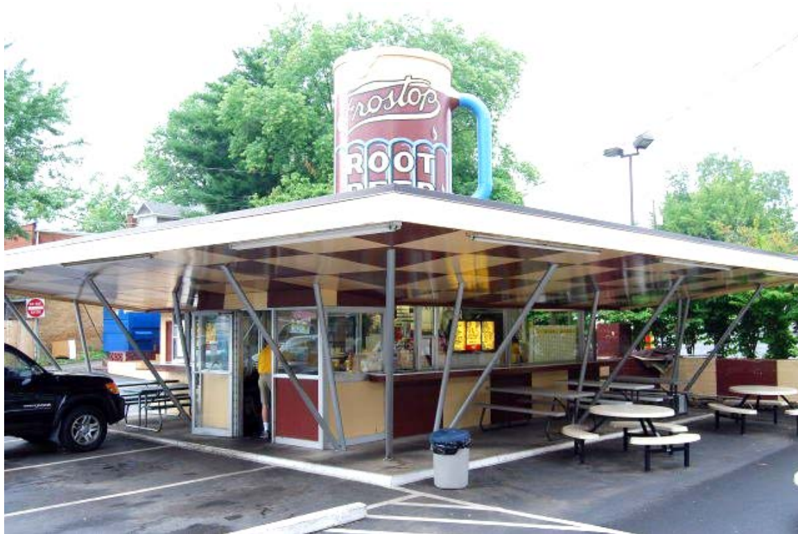
The Frostop Drive-In in Huntington, West Virginia Note the angled metal posts supporting the overhanging roof, identical to those on the current Burnet Road building.