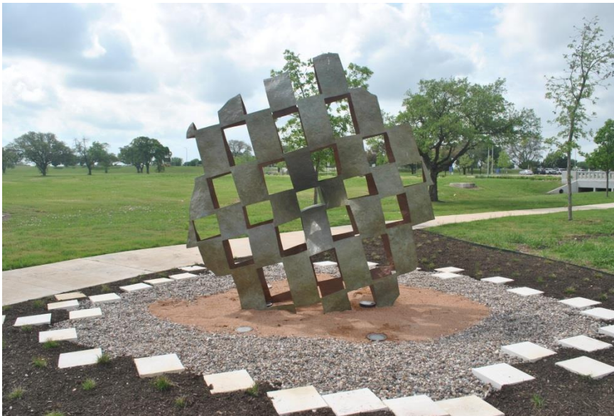
Checkerburst, 2015 Austin-Bergstrom International Airport