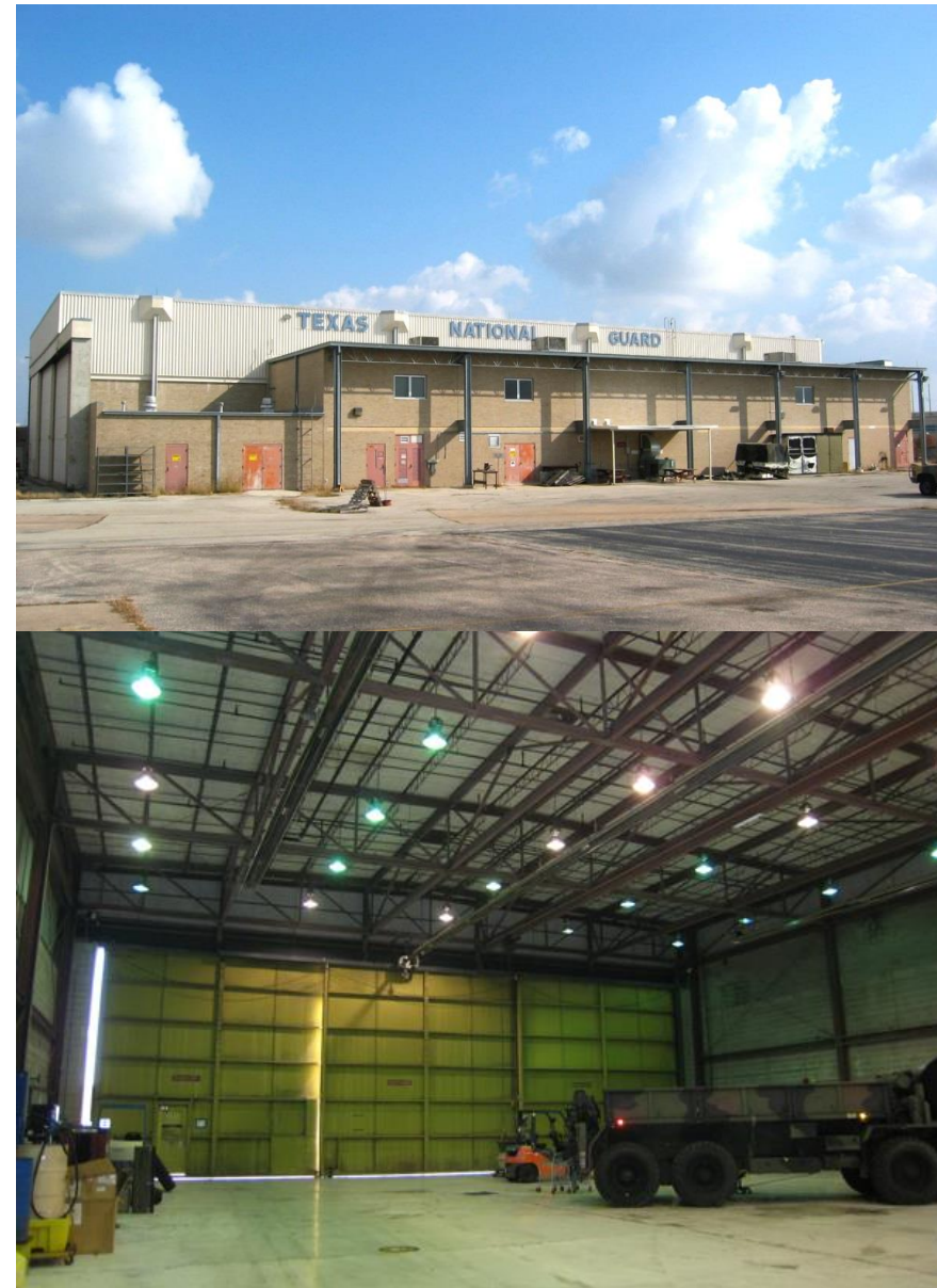
Top: Exterior of former Armory Building Bottom: Interior of former Armory Building