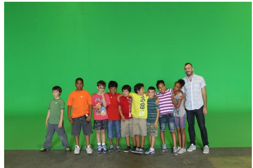
Top: From Dusk Till Dawn – Season 1 Bottom: Field Trips to Austin Studios