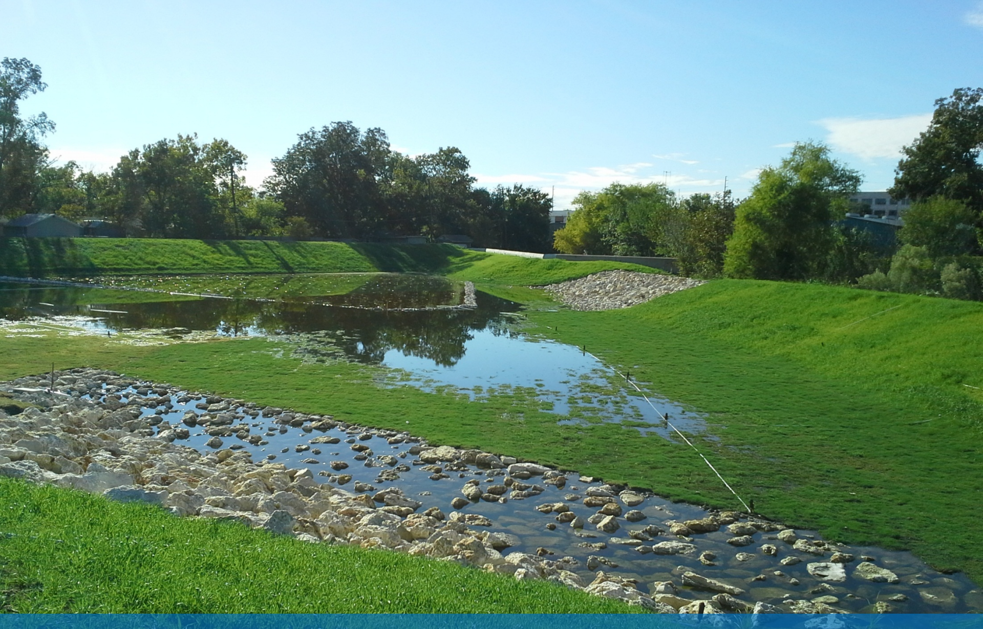
Reilly Pond Flood Detention & Water Quality