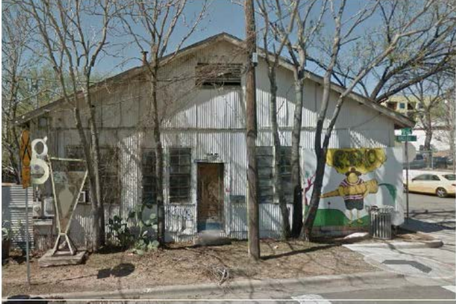
414 Waller Street ca. 1925