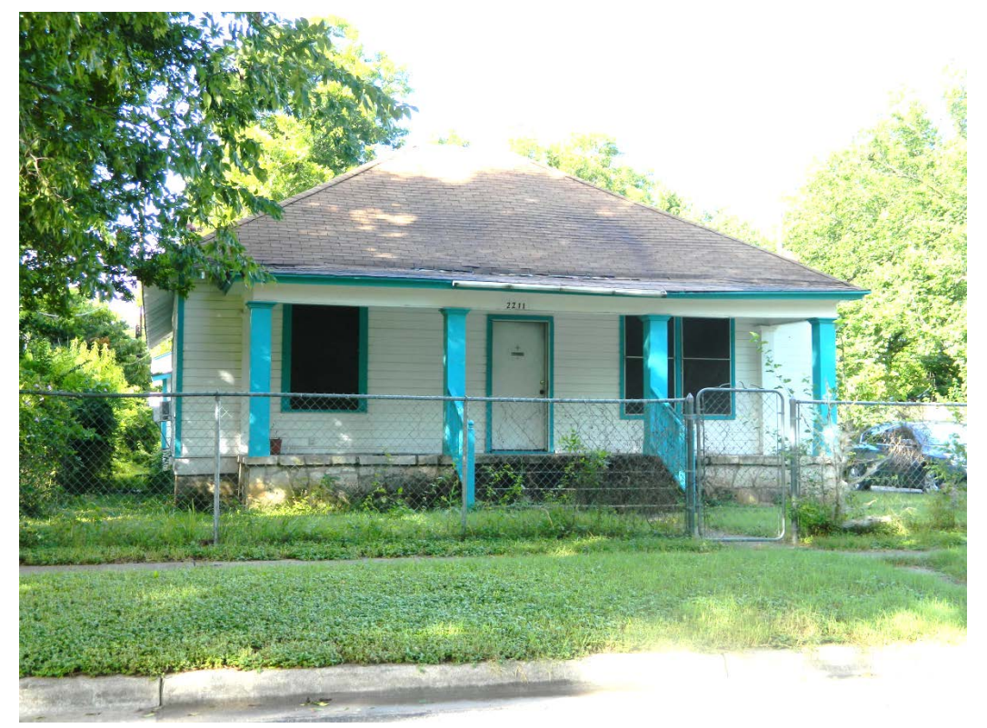
OCCUPANCY HISTORY 2211 Willow Street