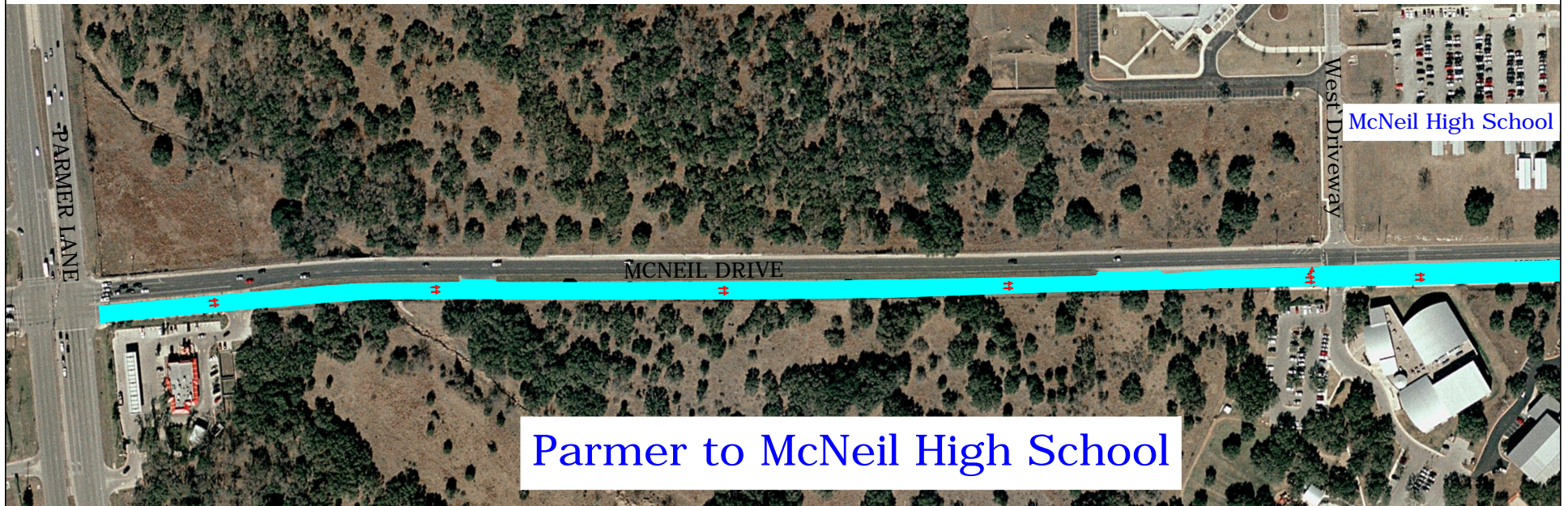
EXHIBIT A (PAGE 1 OF 2)