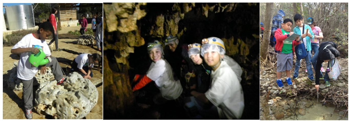
Teacher Comment: "Thank you for bringing our classroom to life. Our students were in such awe of the experience."

Earth Camp targets fifth-grade students attending Title I schools in AISD. Students attend during school hours, and all content is correlated to Texas schools standards. Participating schools attend Earth Camp for free. Teachers receive 6 hours of Continuing Professional Education credit, classroom curriculum, and assist students during Earth Camp field investigations. The City of Austin provides the environmental expertise, teacher training, field trips, tours, lessons, and equipment that make Earth Camp a success. For more information visit www.austintexas.gov/earthcamp.