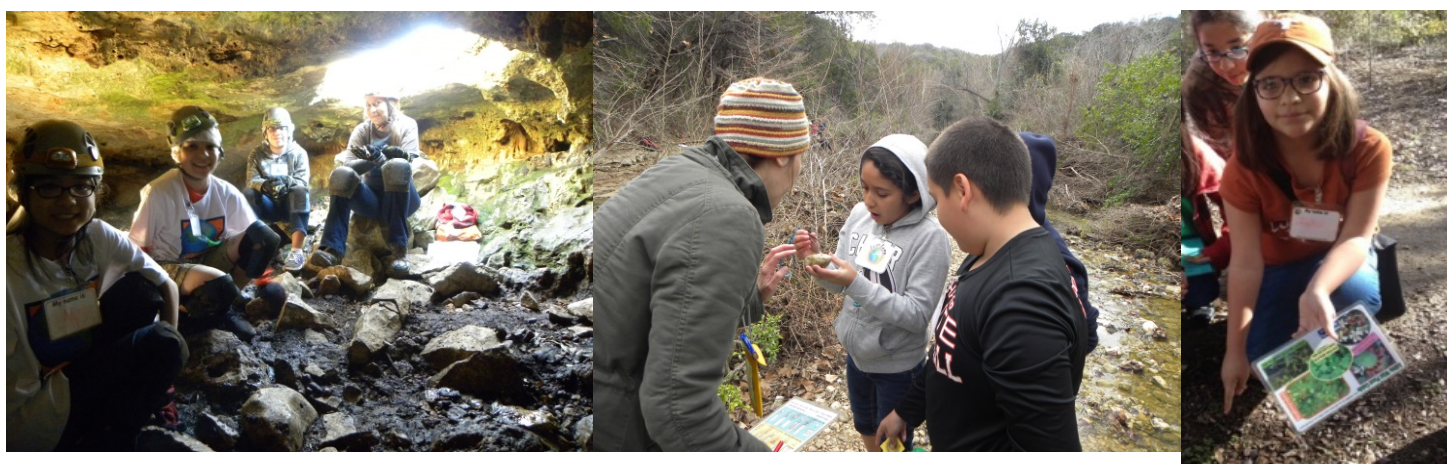
Teacher Comment : "Fabulous camp....great instructor.... A week of outdoor learning is amazing! My students get so much out of it. We learn so much and it puts it all at a level that they can learn and grow. It helps us prepare for a great year in Science."

Teacher-Led Earth Camp encourages Earth Camp trained and mentored AISD teachers to lead Earth Camp with the support of the City of Austin. This allows more classes to participate in Earth Camp than could otherwise be reached by City staff. The City pays for transportation, schedules the field trips, provides materials and hires trained teachers to lead part of the class in order to maintain the small group size necessary for hands-on learning in the field. http://www.austintexas.gov/content/1361/FAQ/5335