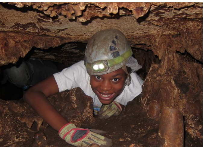
Teacher Comment : "Students loved it! Kids were saying 'this is fun!' It was one of the most engaging activities thus far."