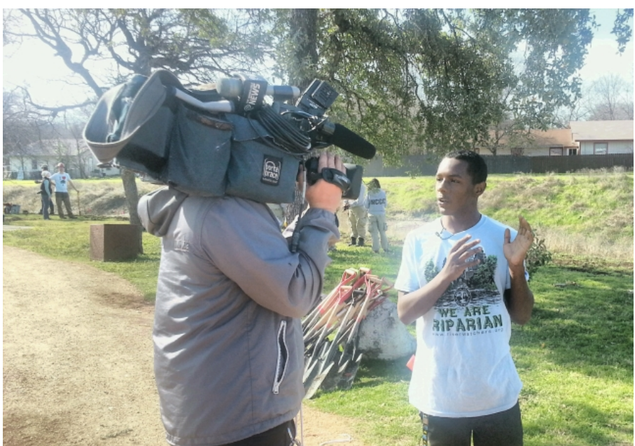
Student Comment : "The science we do in River Watch is fun, because it's outside and it's real. We're doing something for Austin."