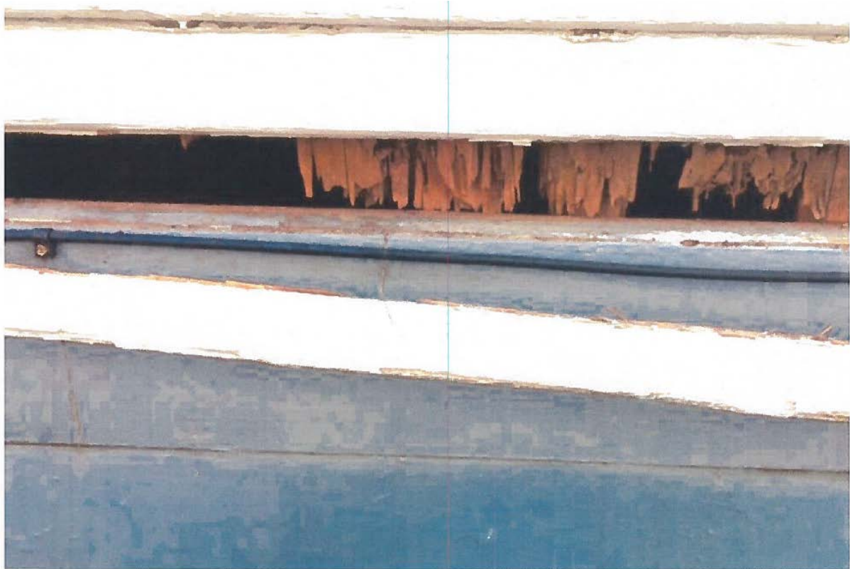
Evidence of wood rot and termite infestation at the house.