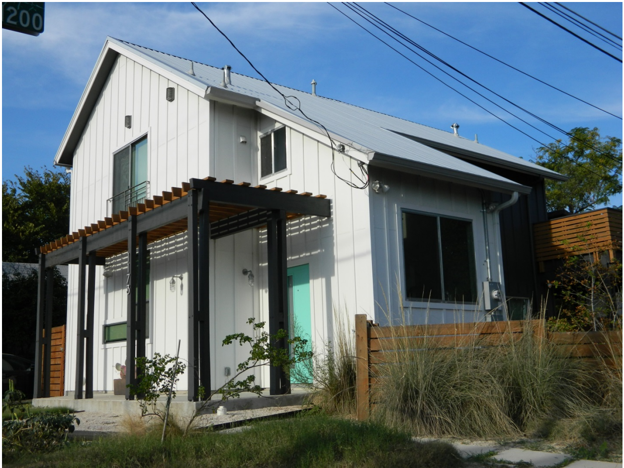
The house at 1173 Navasota Street, on the corner of Hackberry Alley – a portent of things to come without a historic district designation for this row of alley houses.