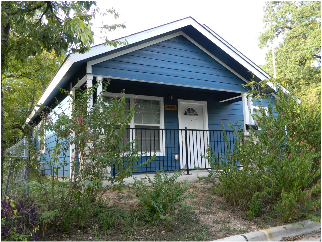
The ca. 2013 house at 1206 Short Hackberry Street is a replacement for an earlier structure, but fits the scale, style, and materials of the historic houses on the alley to a notable degree.