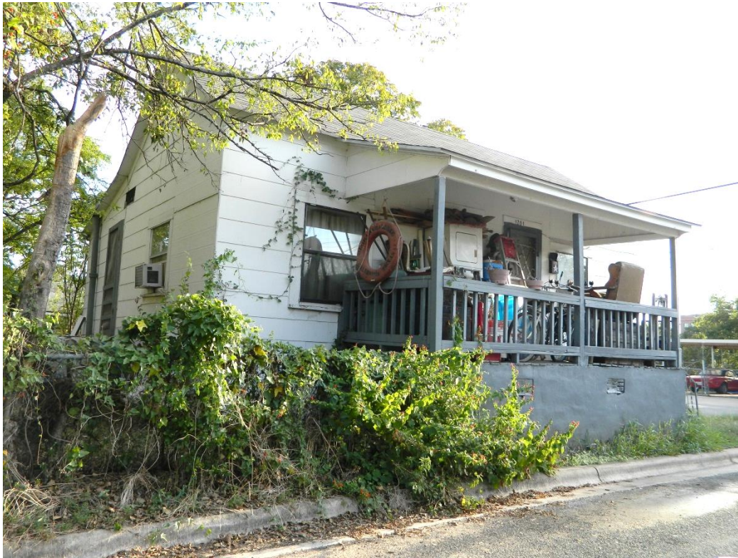
1201 Short Hackberry Street ca. 1915