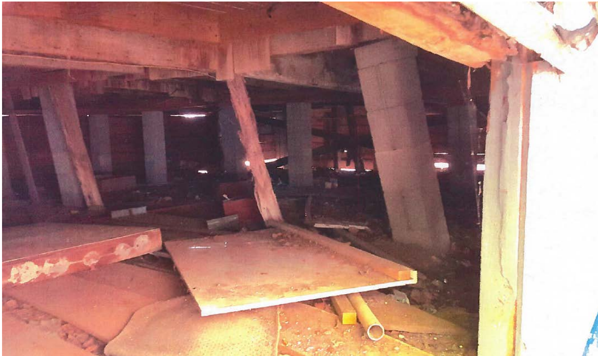
Failing structural piers under the house