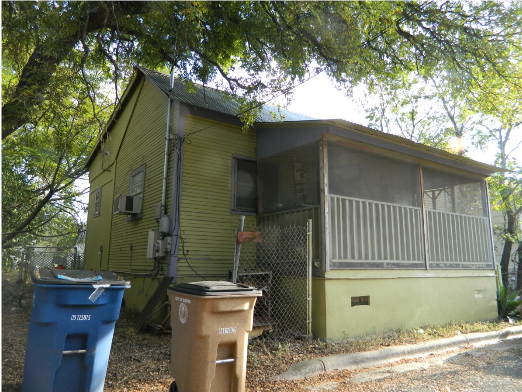
1203 Short Hackberry Street ca. 1913