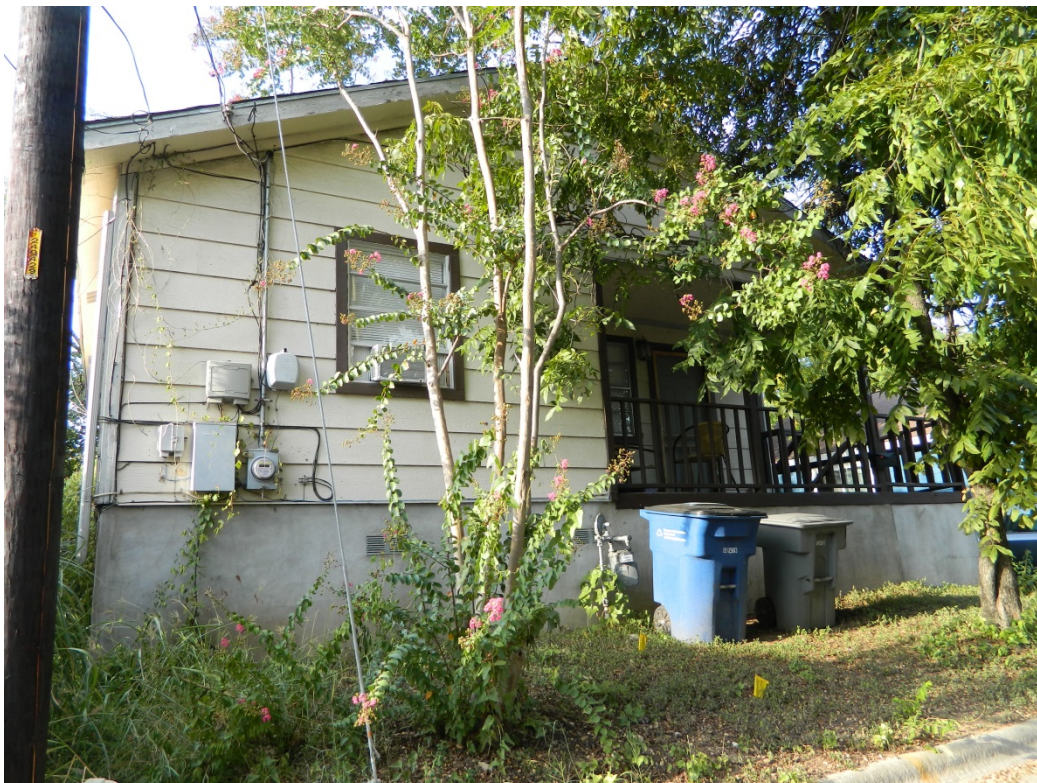
1204 Short Hackberry Street ca. 1915