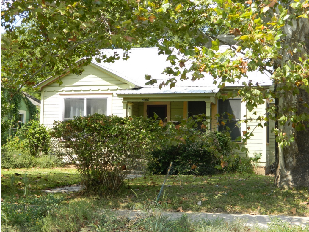
1506 Bouldin Avenue ca. 1939