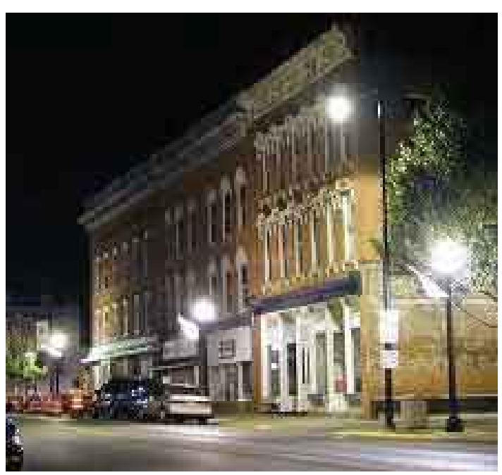
This historic hotel on main street will be converted into a senior citizen residence, which will further increase the population in the historic area.

2. Main Street Galion, in Galion, Ohio has used State CDBG money to leverage 10 million dollars of funding from public and private sources to revitalize their "historic uptown" area, which had fallen into decline due to plant closures. Projects included facade work, rehabilitation and infrastructure improvements. Additionally, the main square was restored and an historic walking tour was developed to promote Galion as a tourist destination. Businesses have returned to the district helping to generate more revenue for the city and providing needed services to residents and tourists. Main Street Galion redevelopment initiatives include the rehabilitated historic theater, which originally opened in 1949 as an art-deco movie theater and boasts to having the only original intact neon marquee in Ohio. Also, a historic hotel on main street will be converted into a senior citizen residence, which will further increase the population in the historic area. Contact: Main Street Galion at (419) 468-4812 ext 204, www.galionohio.com.