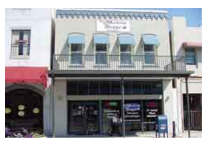
Another goal was bringing the oldest buildings, which were built between 1906 and 1926, up to code and making them accessible to the disabled.