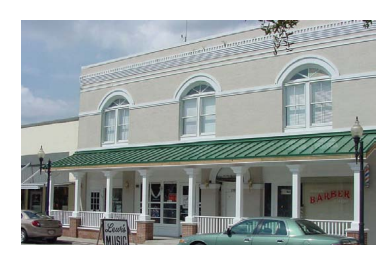
This project involved improvements to the parking lot, lighting, signage and making the area more pedestrian friendly by adding sidewalks from the historic courthouse to the downtown.