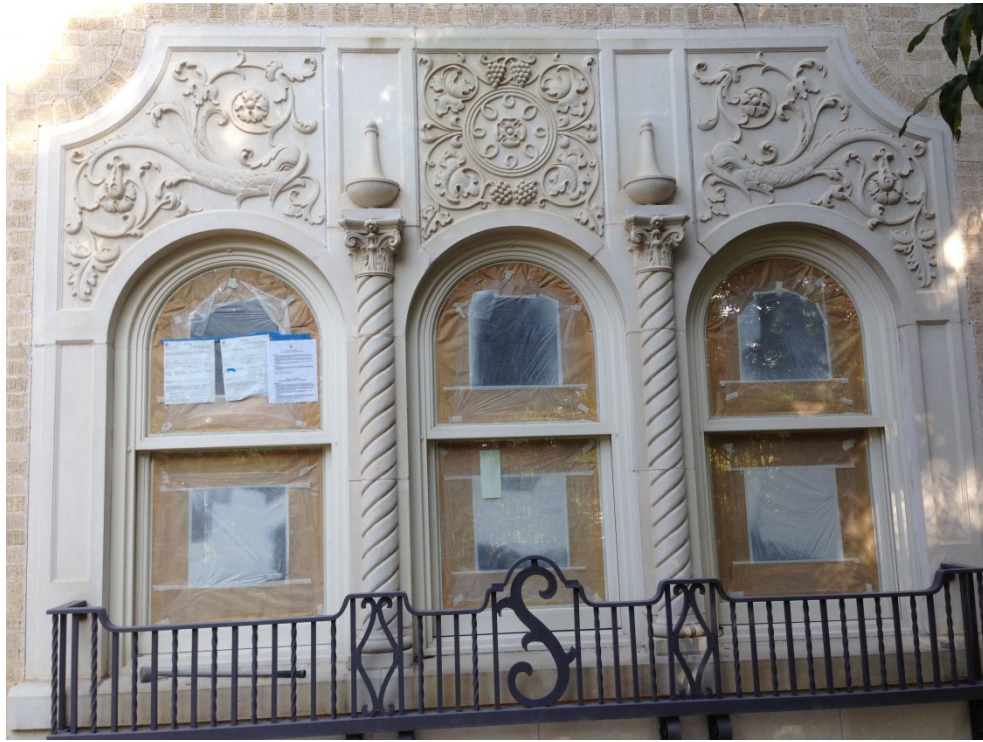
Ornate exterior stonework with the S initial ironwork by Fortunat Weigl