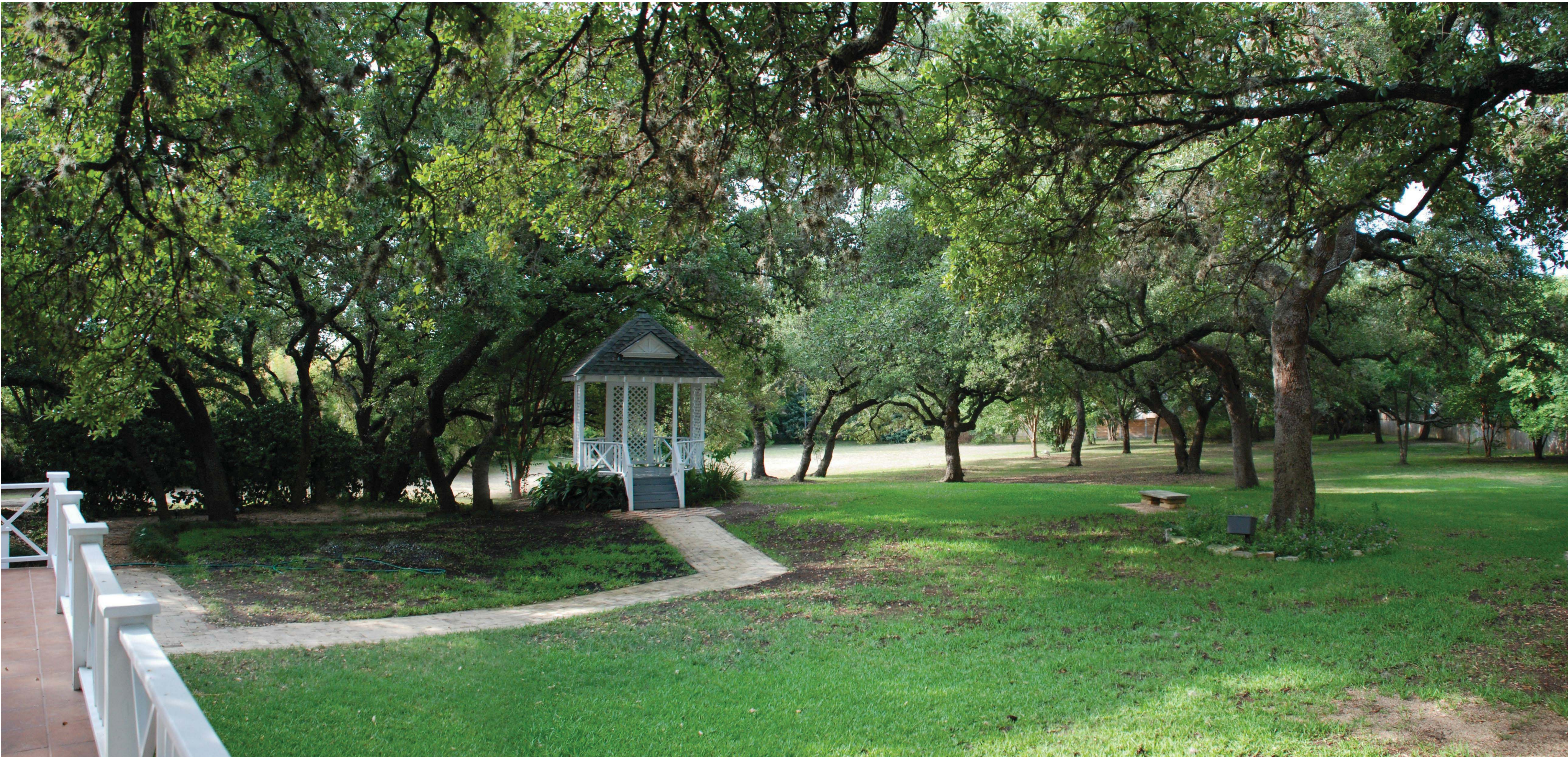
View of Building B site from historic building