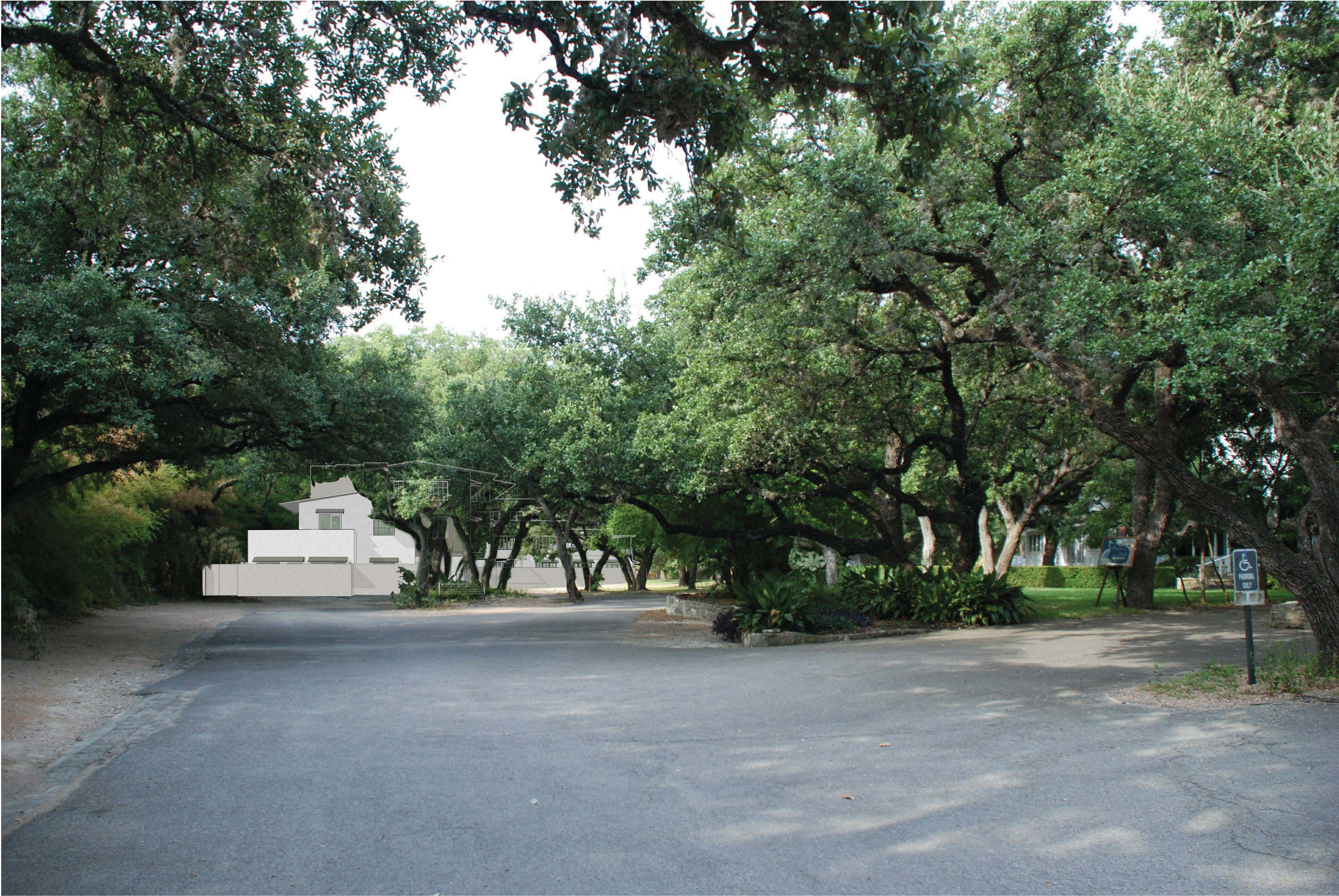
View of proposed Building B from drive

FIELD INSPECTION REQUIRED Prior to performing any bidding, new construction, and/or repairs, general contractor shall visit the site, inspect all existing conditions, and report any discrepancies to the architect.