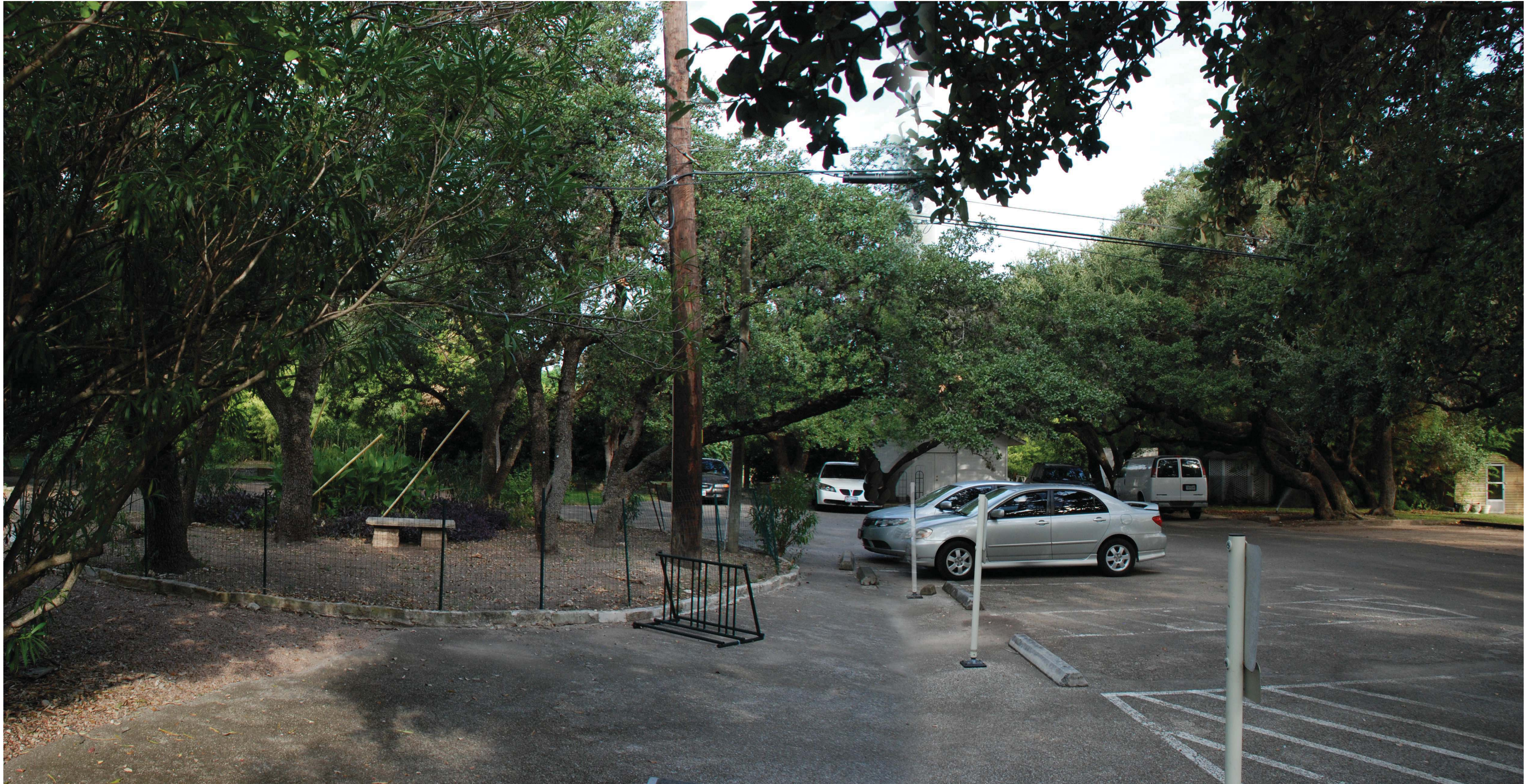
View of Building A site from historic building

Prior to performing any bidding, new construction, and/or repairs, general contractor shall visit the site, inspect all existing conditions, and report any discrepancies to the architect.