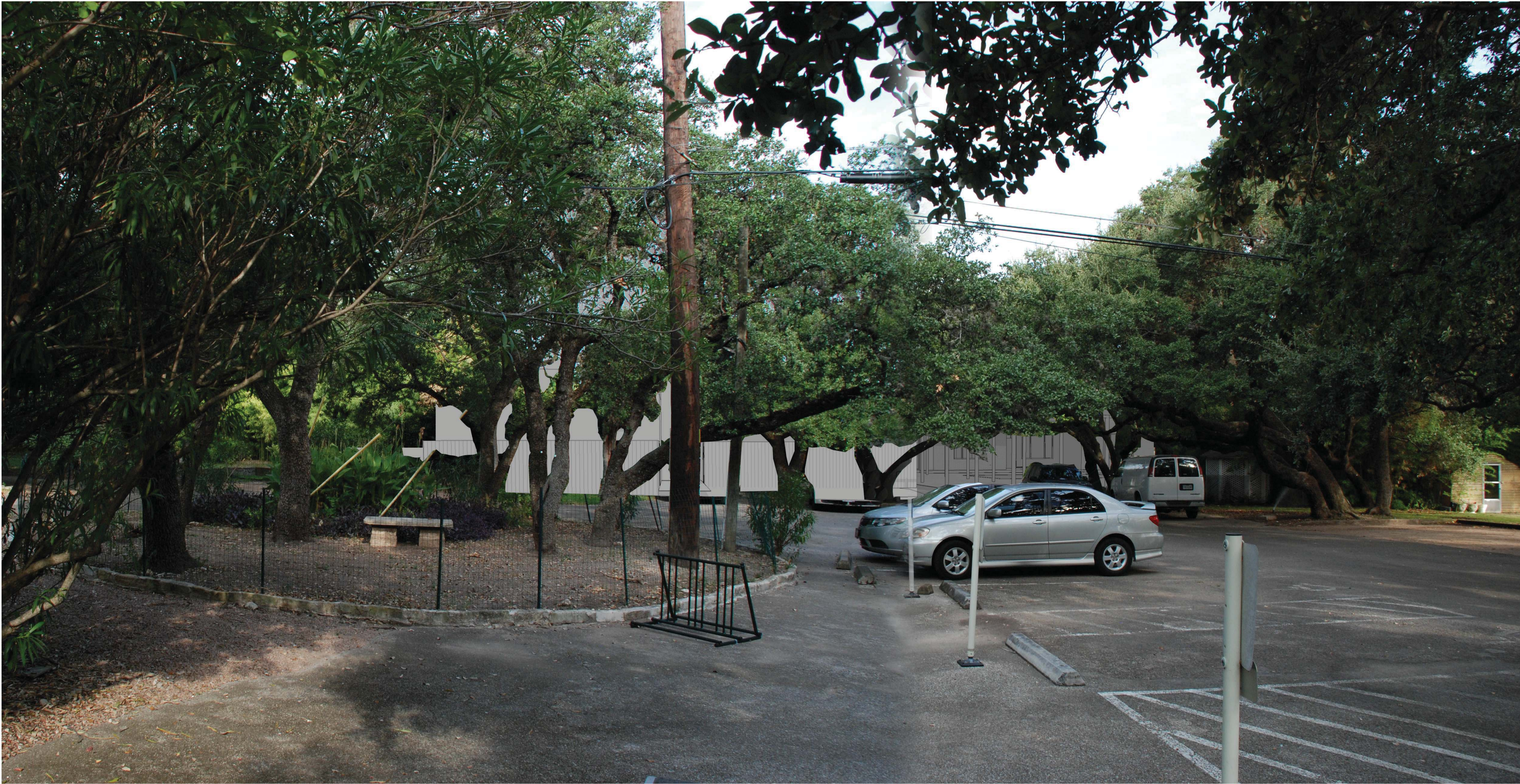
View of proposed Building A from historic building