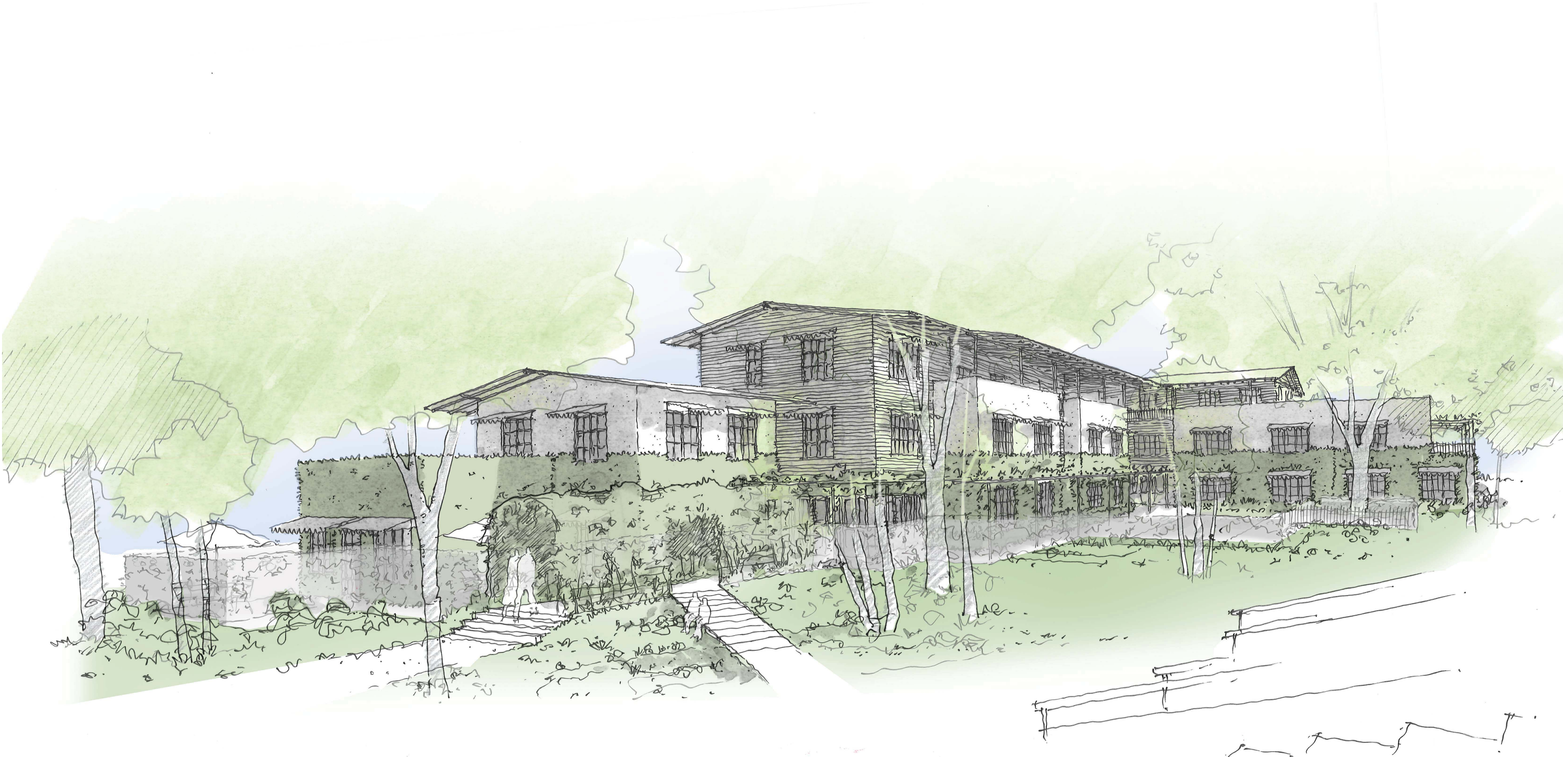
Building B - Northwest Elevation Perspective