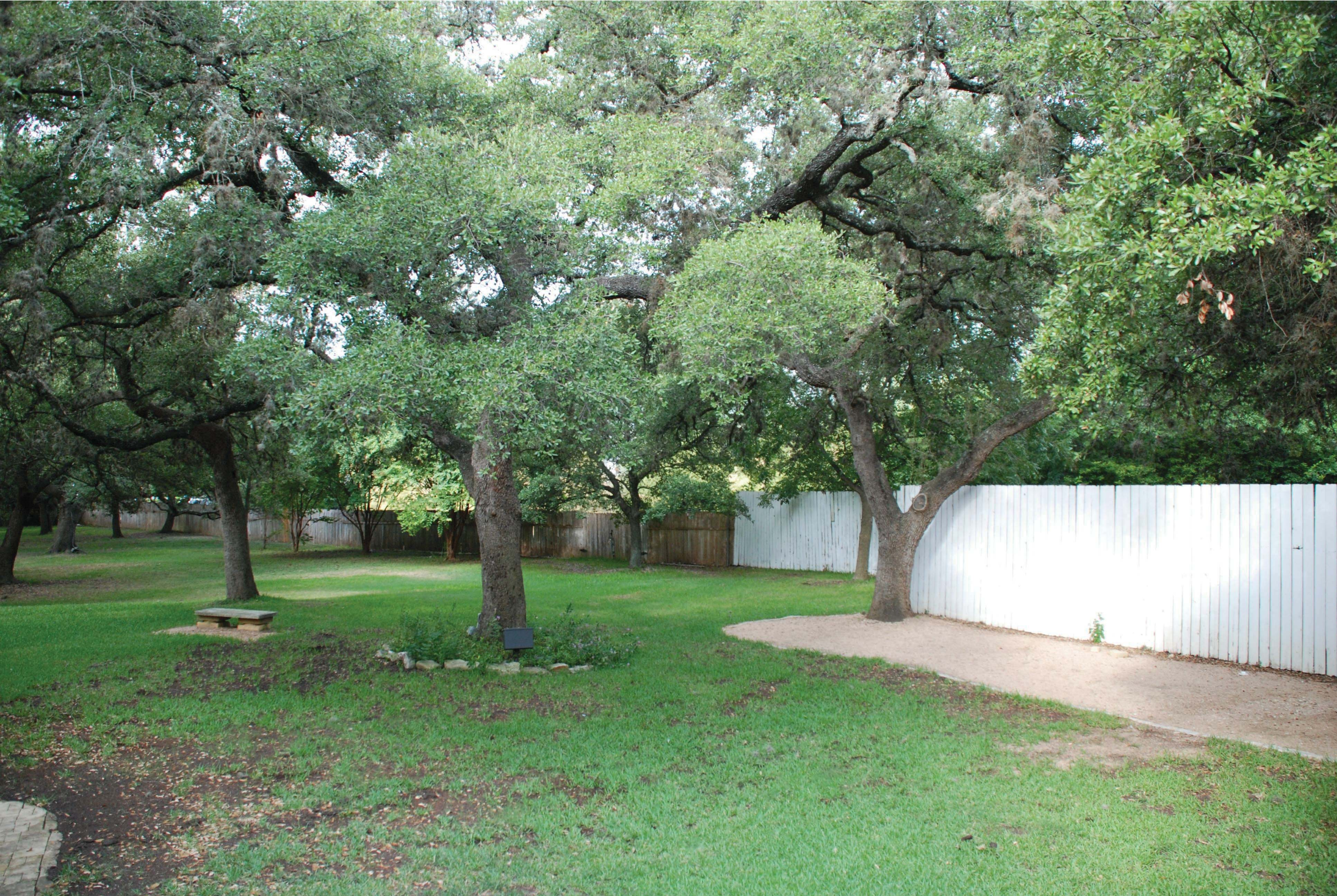
View towards Building D site from historic building