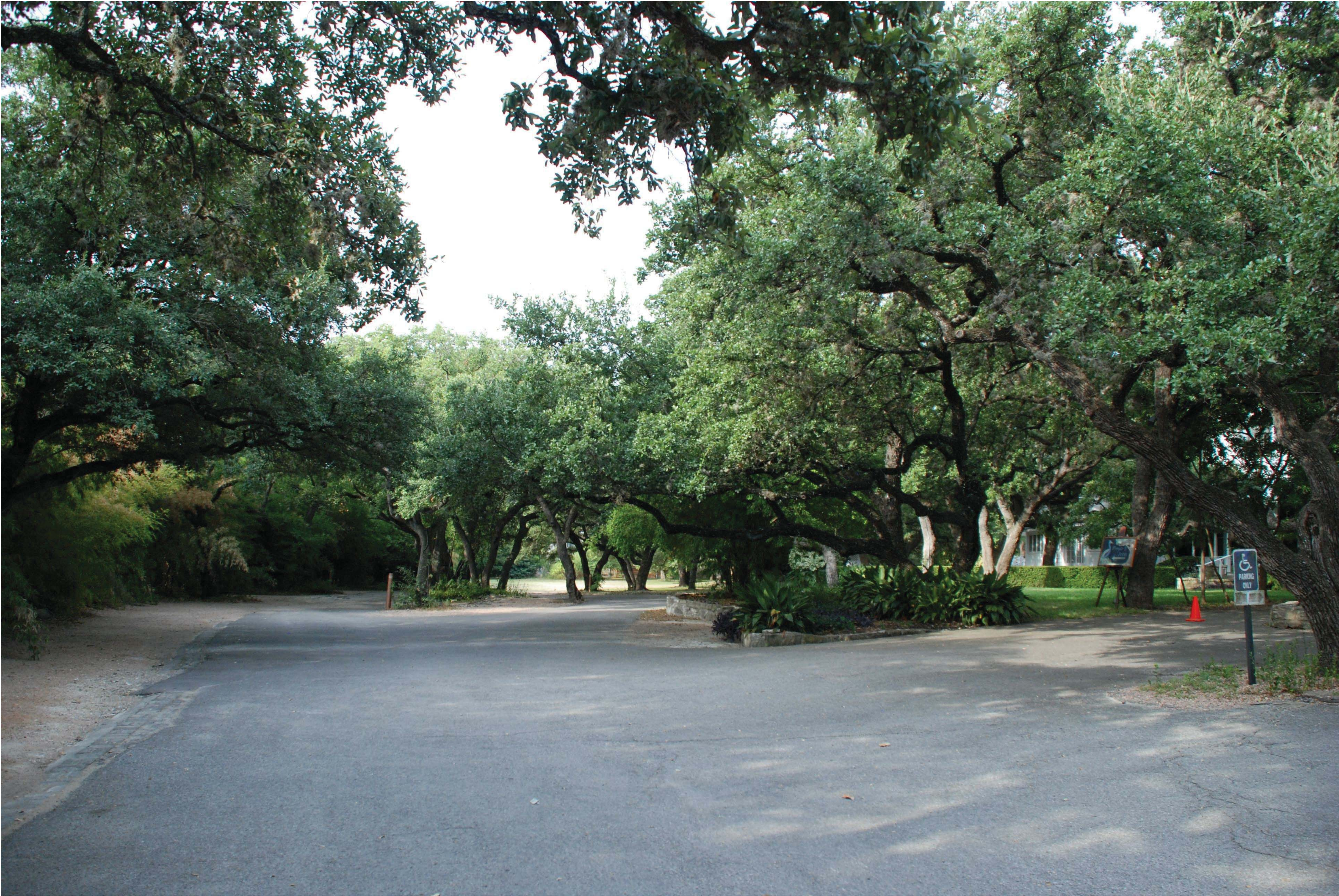
View of Building B site from drive