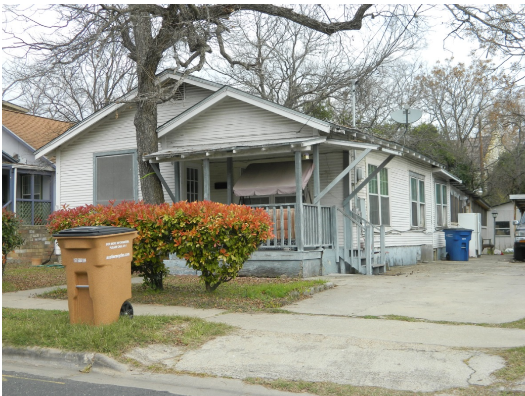
OCCUPANCY HISTORY 710 W. Johanna Street