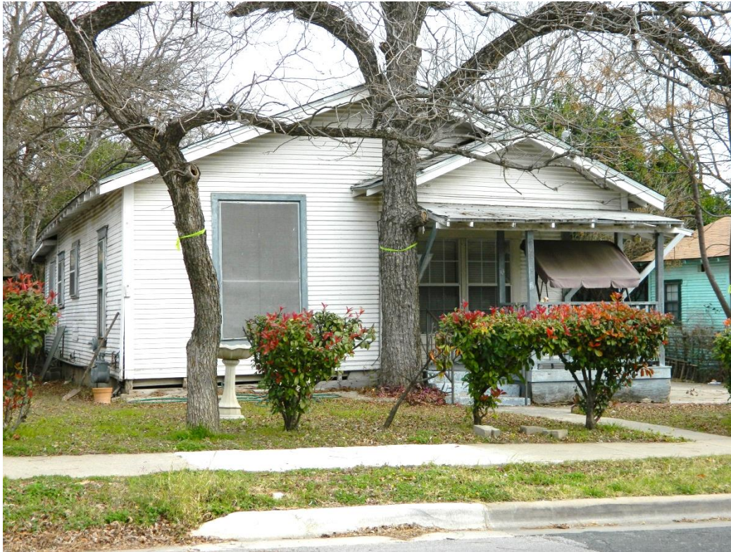
710 W. Johanna Street ca. 1928