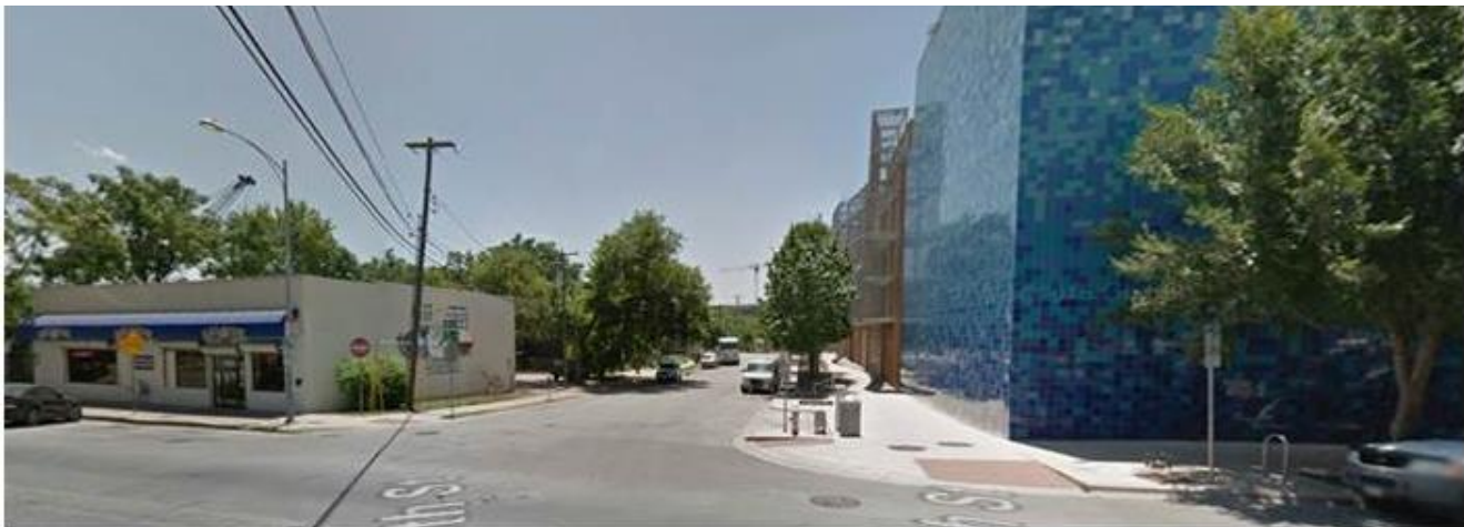
Same view as above of Sabine Street's existing conditions at the intersection Fifth Street, looking south. Big Chiller Blues is shown at right.