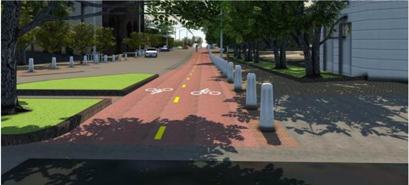
View of proposed Sabine Street at the intersection Sixth Street looking south. Bike lane and bollards will be added to the street and the curb will be removed, making it a “woonerf” or festival street. The tree shown at the left is the same tree shown in the photo below at the left.