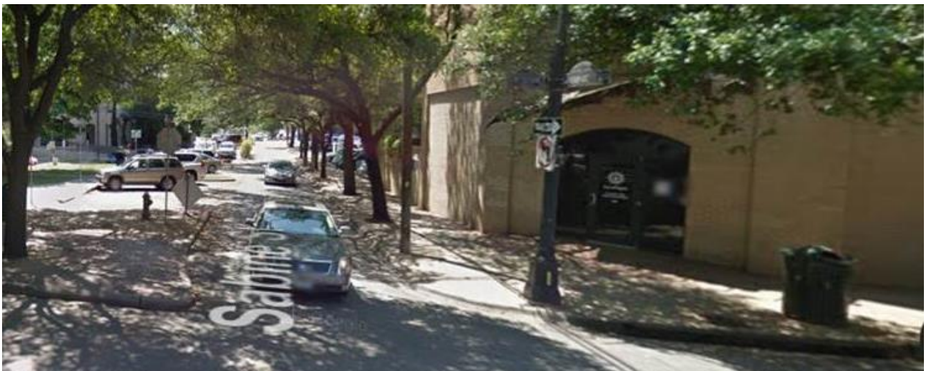
View of existing Sabine Street, at the intersection Sixth Street, looking south.