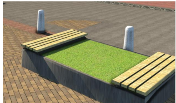
Planned planter/benches and bollards

The selected artist will integrate their artwork into the planned site improvements, such as the railing, bench(es), bollard(s), planter(s) or steps. The artist could affect one or more of the ten planter/benches planned for Sabine Street, shown at right.