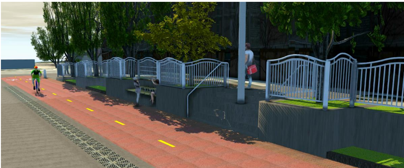
Proposed landscapes areas, railing and bench along the west side of Sabine Street between 4 th and 5 th Streets.