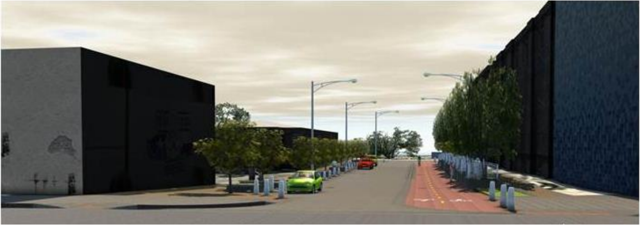
View of proposed Sabine Street, at the intersection Fifth Street looking south. Bike lane and bollards are shown – existing railing and stairs will be replaced by new railing and some of the stairs will become seating opportunities. Parking will be on the east side of the street only.