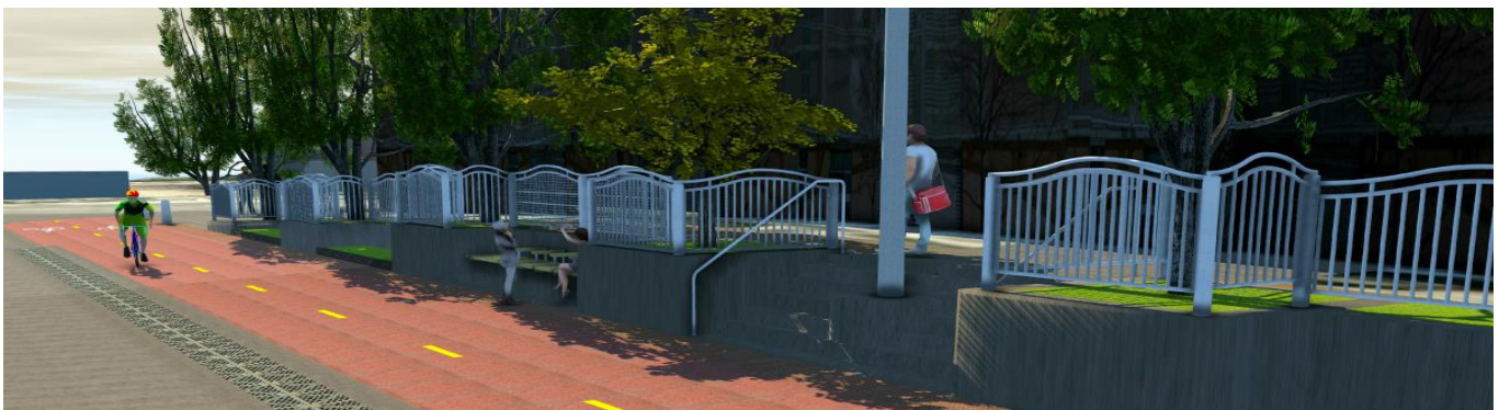
Planned railing, bench, and steps between 4 th and 5 th along the west side of Sabine Street

As part of the design phase, the selected artist will propose their location for the artwork, subject to City approval, within the public right-of-way along Sabine Street between Fourth and Sixth Streets. The selected artist will take care not to obstruct the pedestrian way with the artwork. Artwork should not encroach into the National Historic District at Sixth Street.