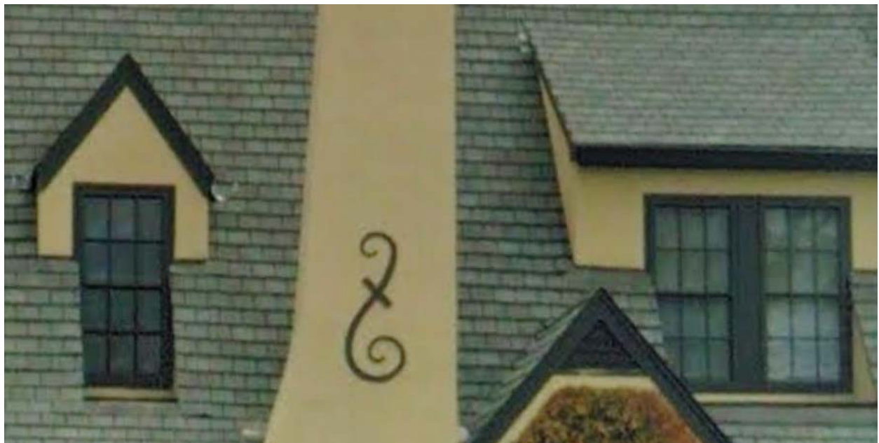
Photograph taken near the time that the house was landmarked (2009)