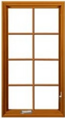
Proposed window modifications