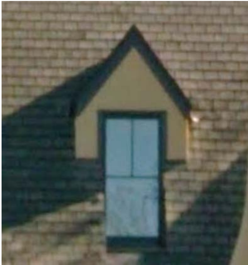
Close-up of a replacement window