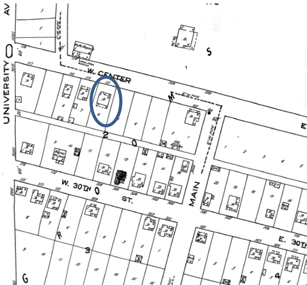
The house appears on the 1922 Sanborn map with an address of 111 W. Center (31 st ) Street. This is the first map to show this section of the city.