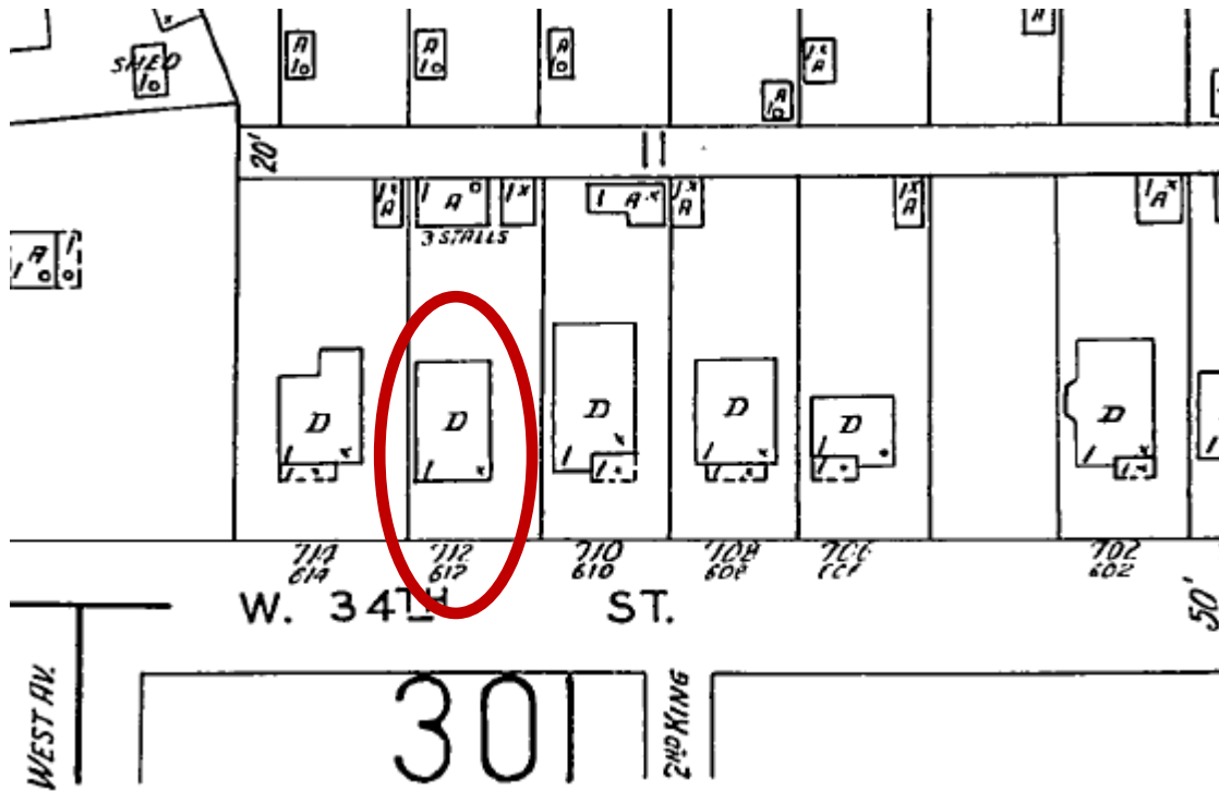
The 1935 Sanborn map shows the house with its current address of 712 W. 34 th Street and its old address of 612 W. 34 th Street.