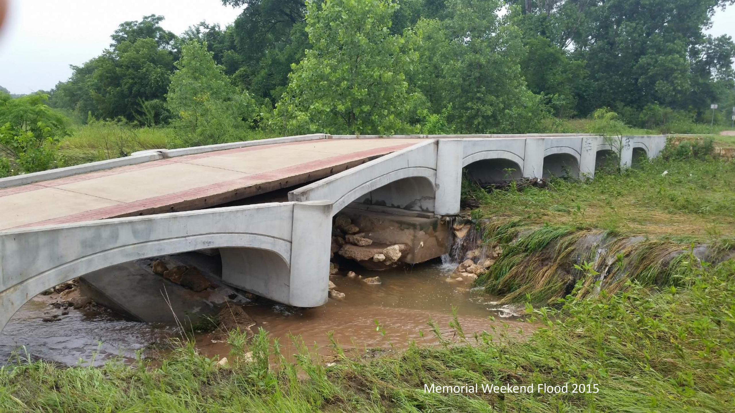
Memorial Weekend Flood 2015