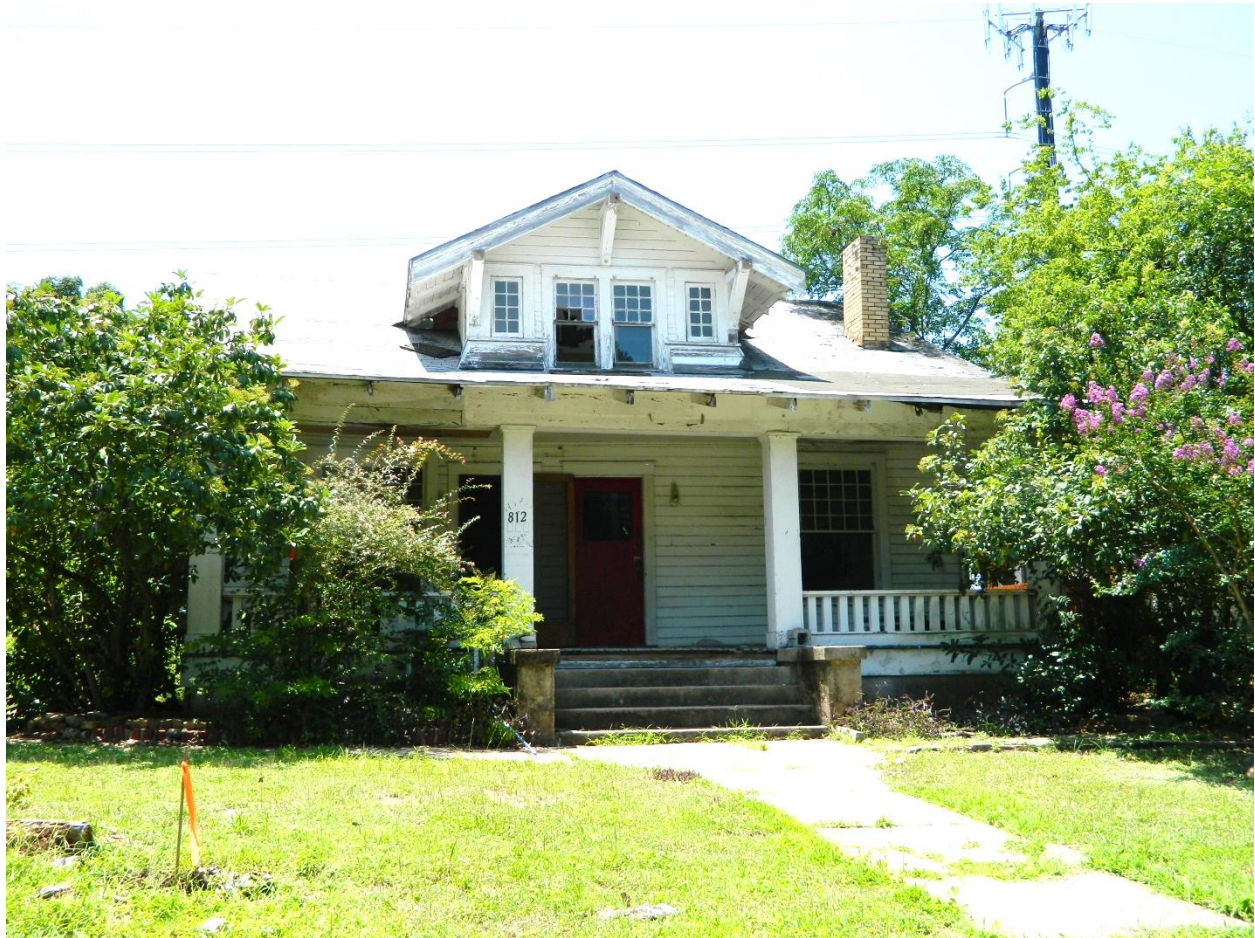
Photograph of the house taken June, 2016

this house beyond the reasonable expectation of rehabilitation and restoration. The applicant for the demolition permit has contacted structural engineers and builders to determine the cost of rehabilitation, which is around $500,000.