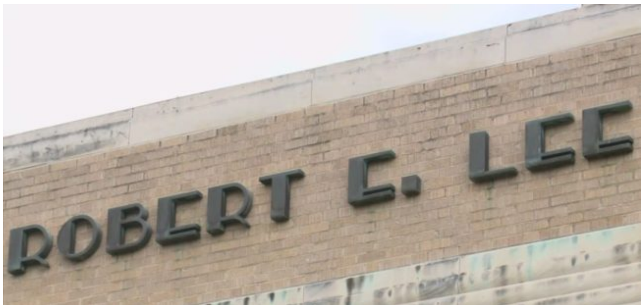
Art Deco-style lettering on the school