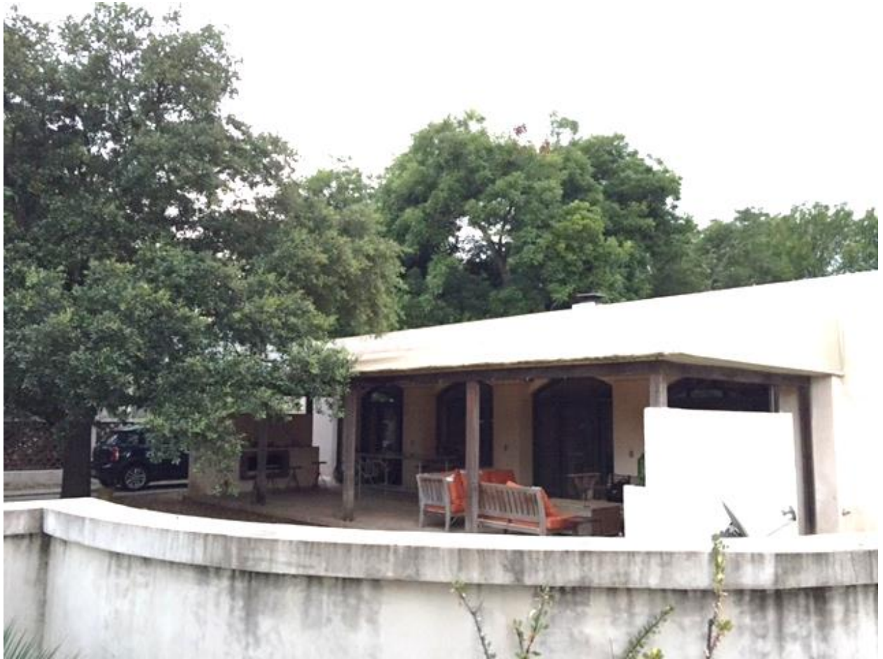
East and north facades of the house