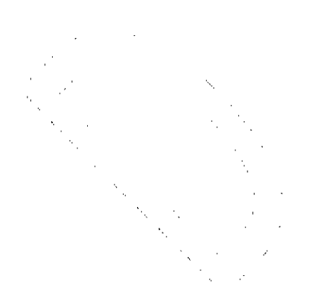
Exhibit G: Joint Election Agreements