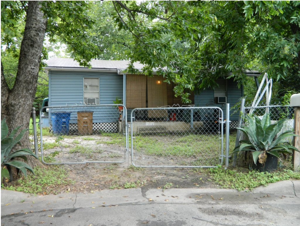
Photograph taken August, 2016