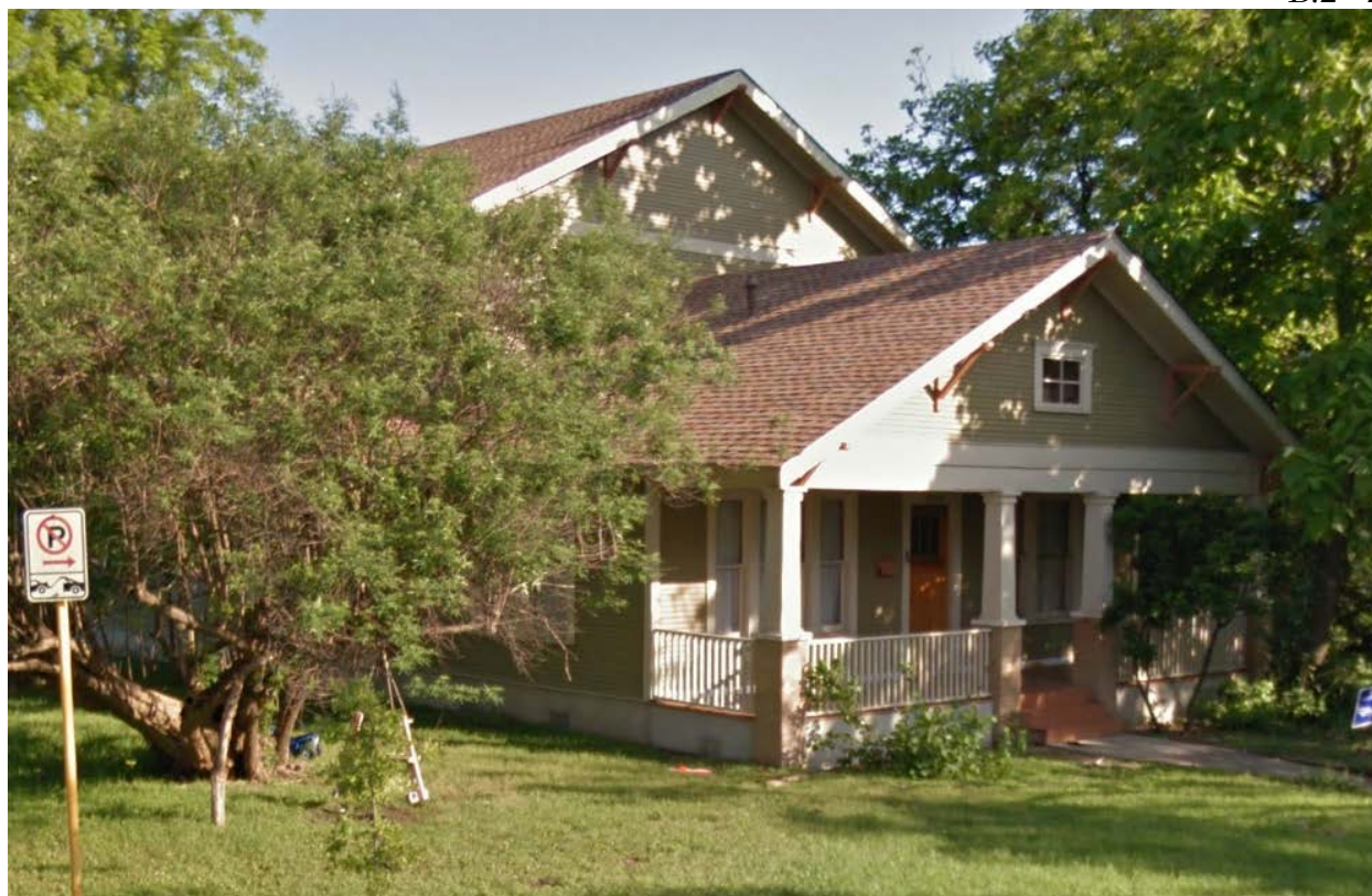
3913 Avenue F from the corner of 40 th Street.