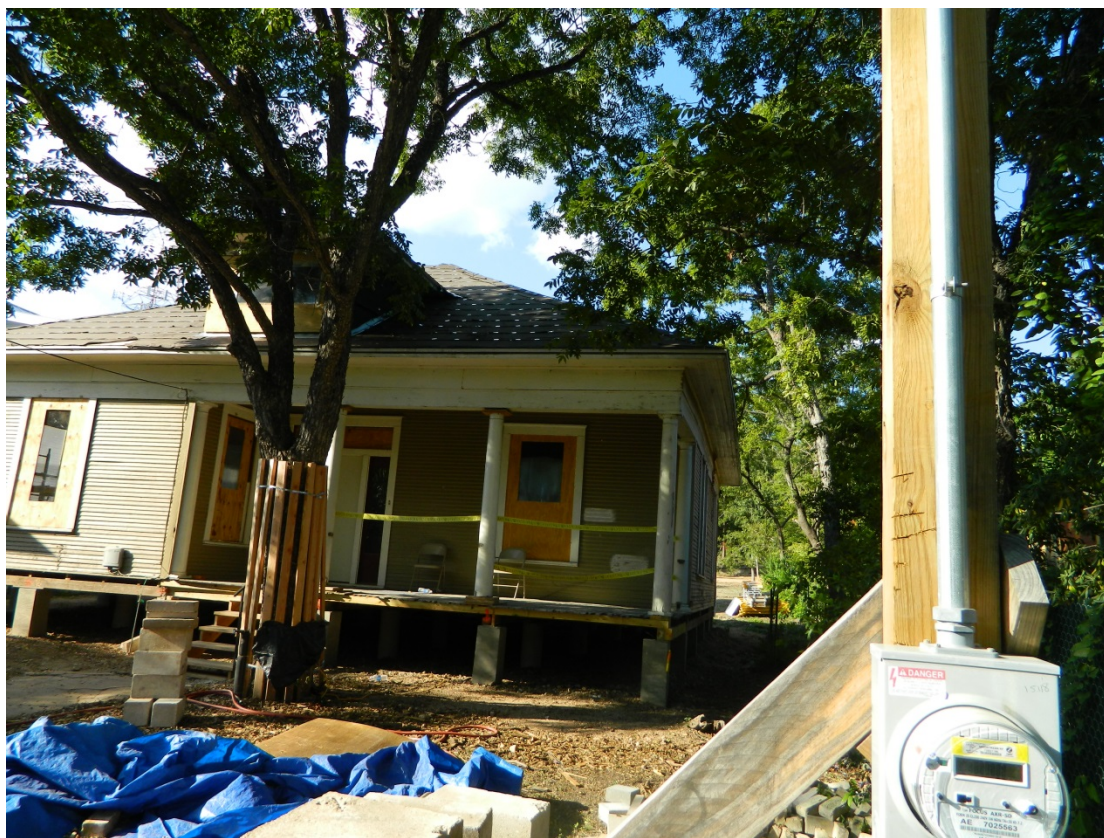
Side of the house that will have the addition