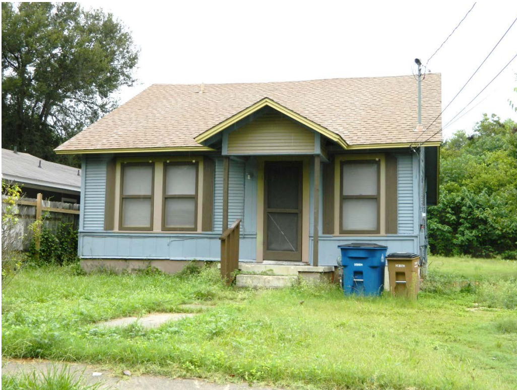
Photograph taken August, 2016