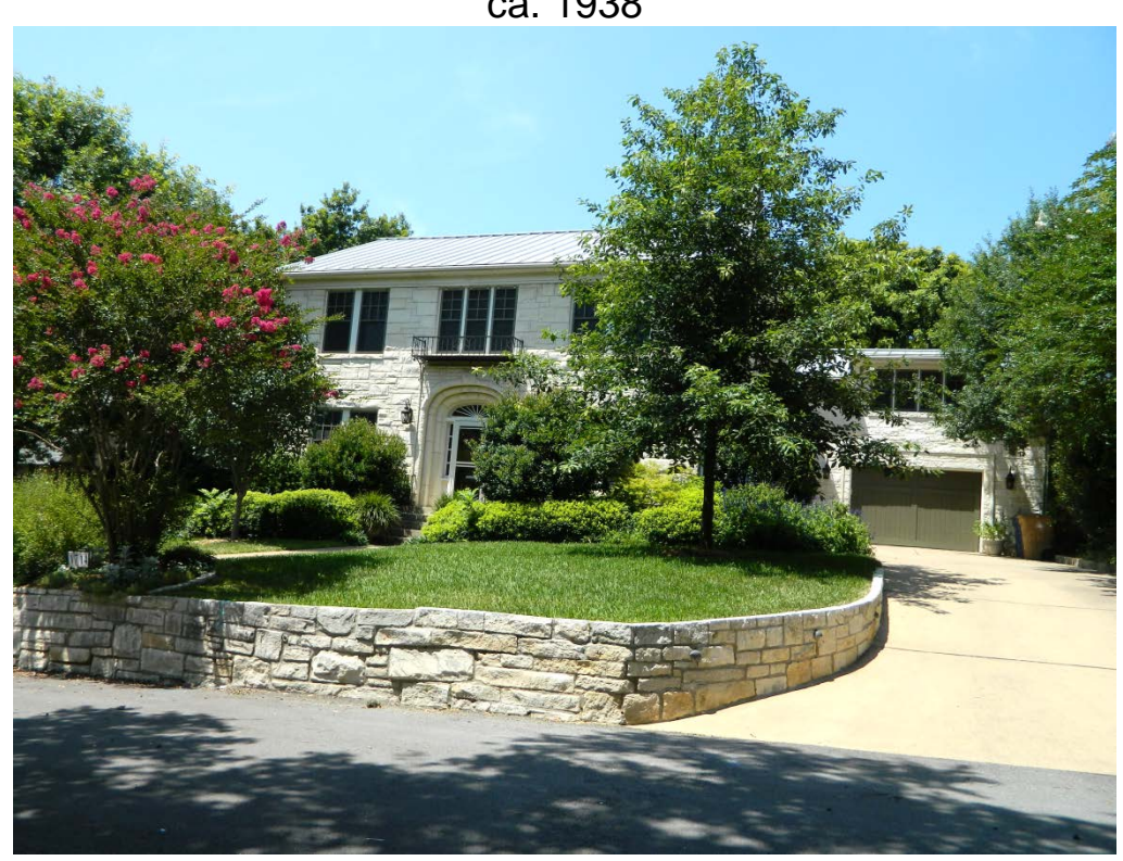
1714 Cromwell Hill ca. 1938