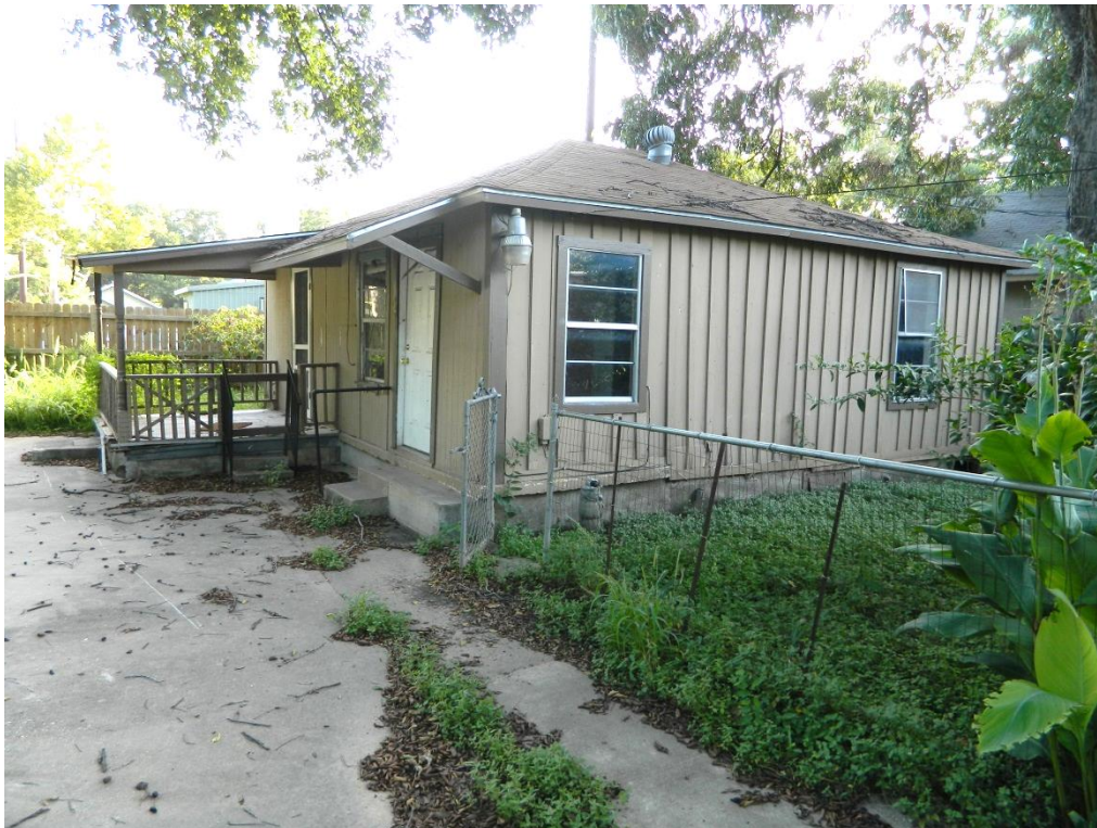
Rear house, ca. 1950