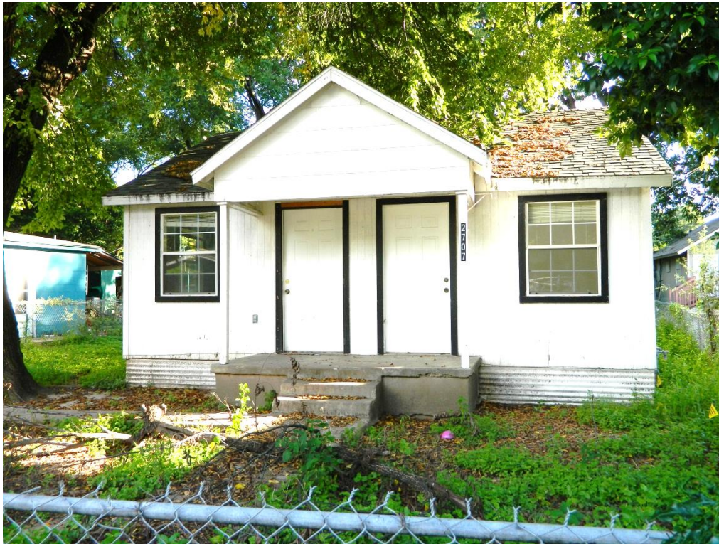
Front house, ca. 1950